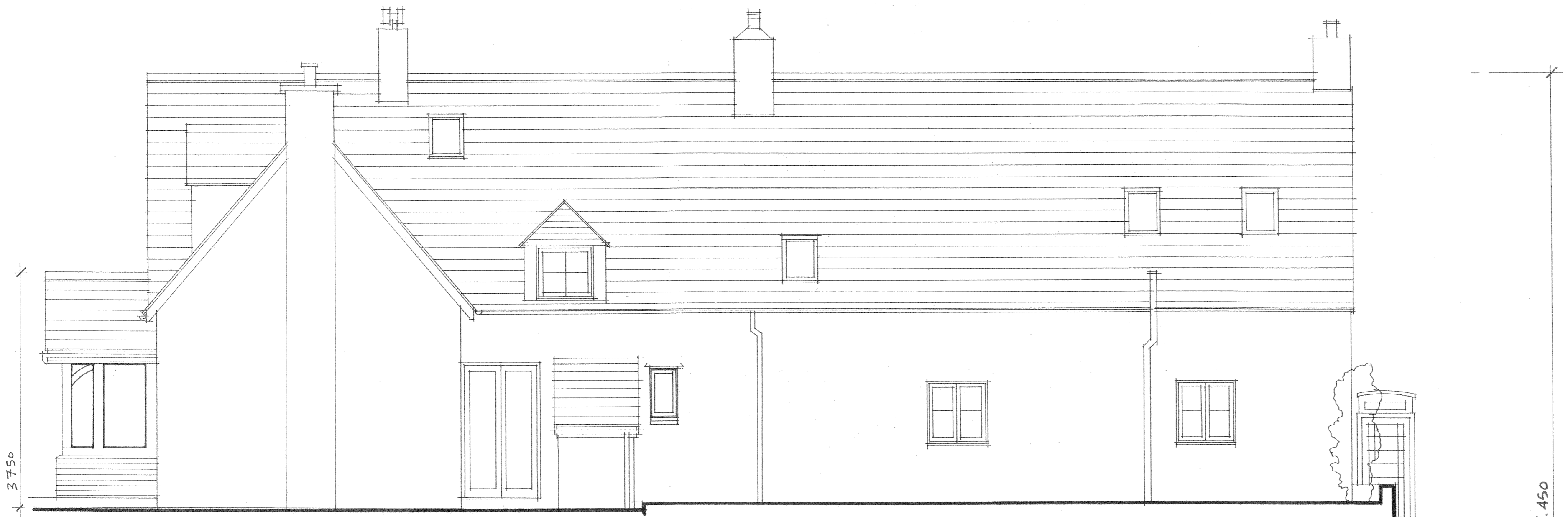
EAST ELEVATION AS PROPOSED