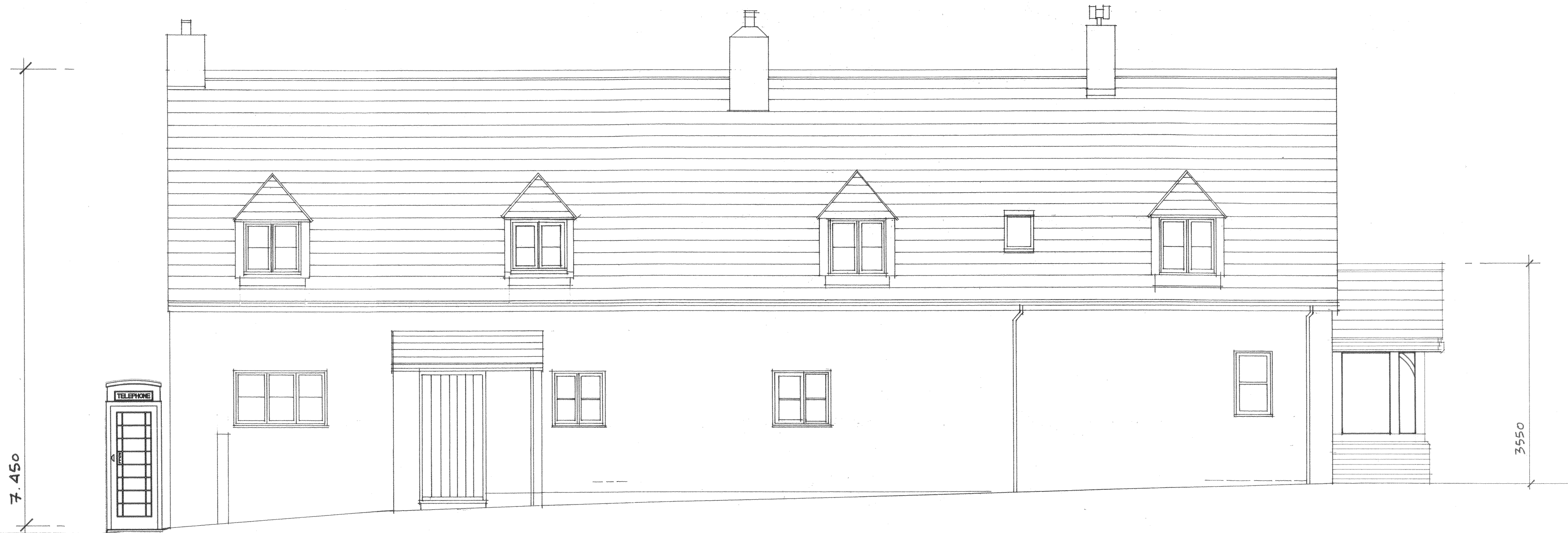
WEST ELEVATION AS PROPOSED