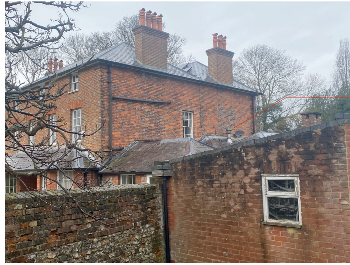
IMAGE OF ELEVATION OF EASTERN GABLE WALL