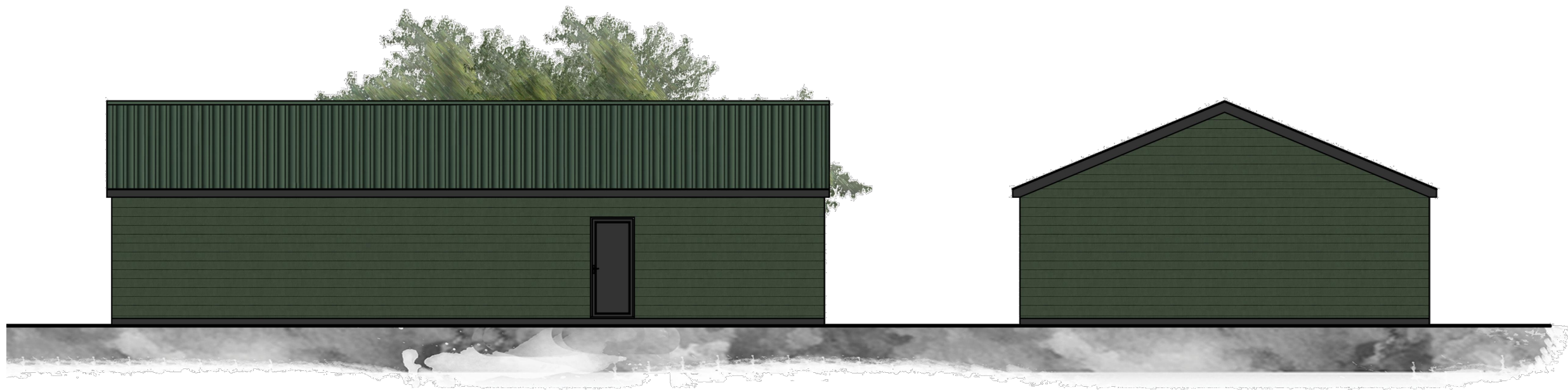
Proposed Rear Elevation 1:100 @ A3