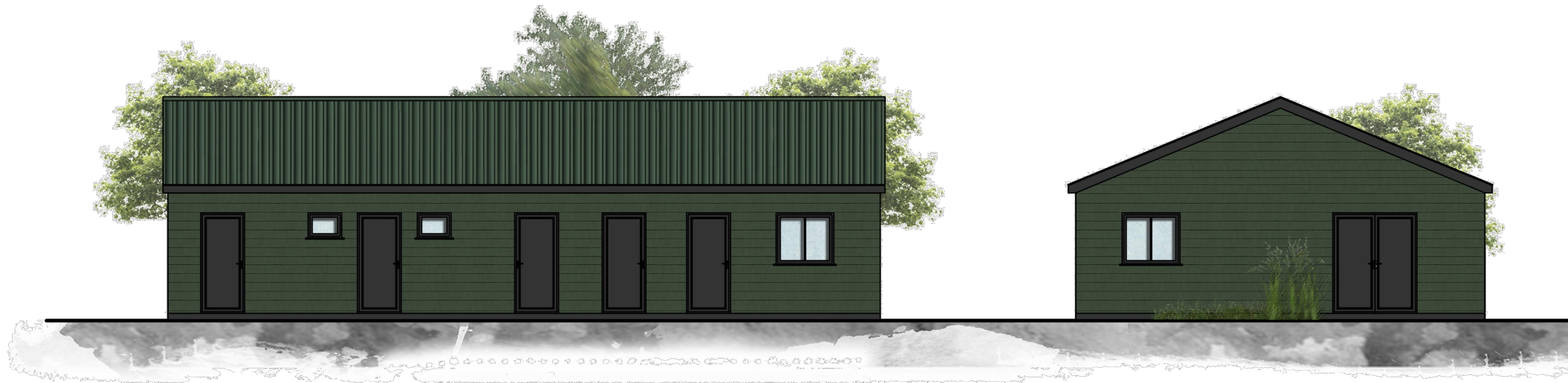
Proposed Front Elevation 1:100 @ A3