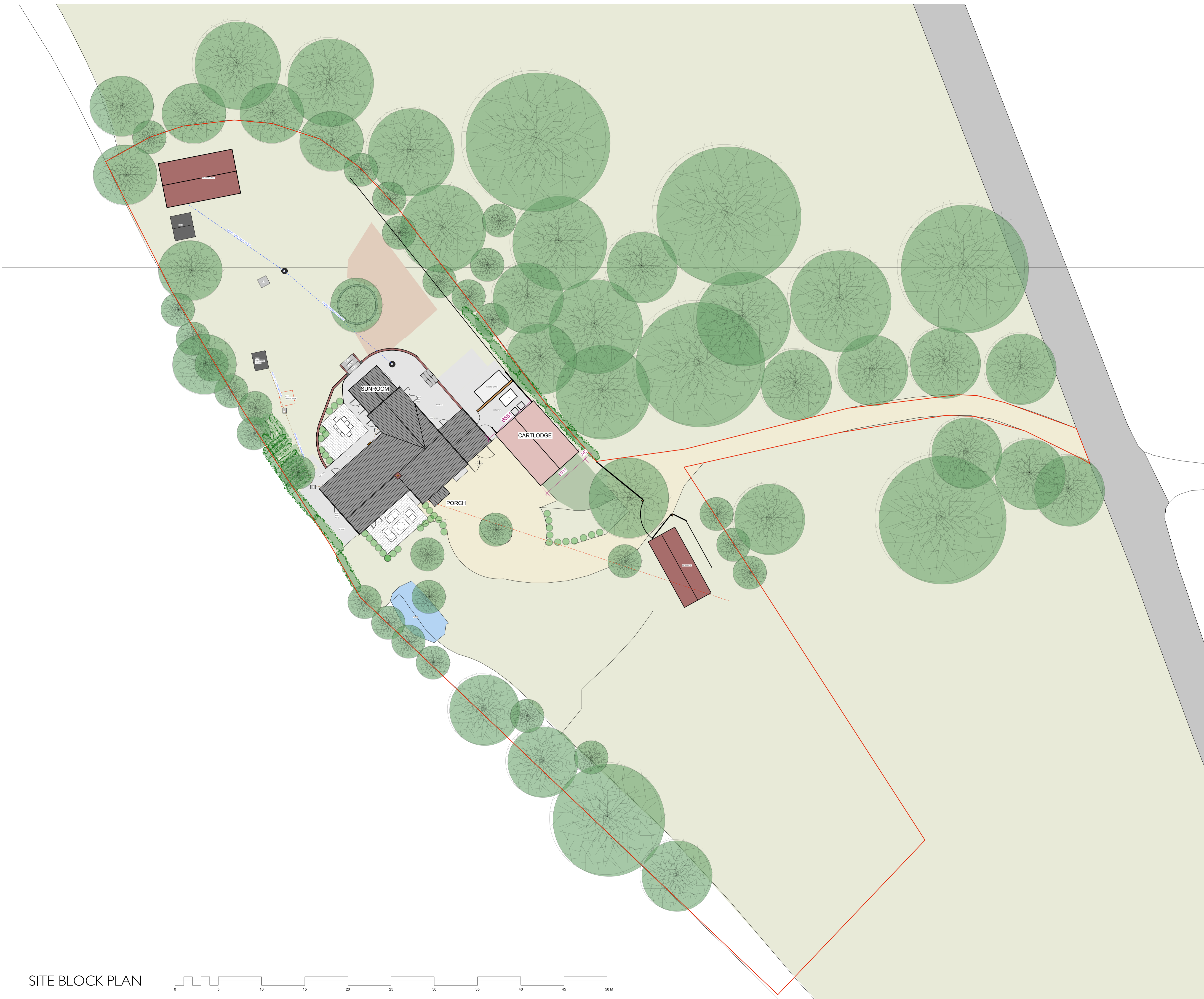
SITE BLOCK PLAN

General Notes 1. Do not scale this drawing. All dimensions to be as noted. Contractor to check all dimensions on site before carry out works. 2. This drawing is for the private and confidential use of the client for whom it was undertaken and it should not be reproduced in whole or in part or relied upon by third parties for any use without the express written authority of Beech Architects Limited.