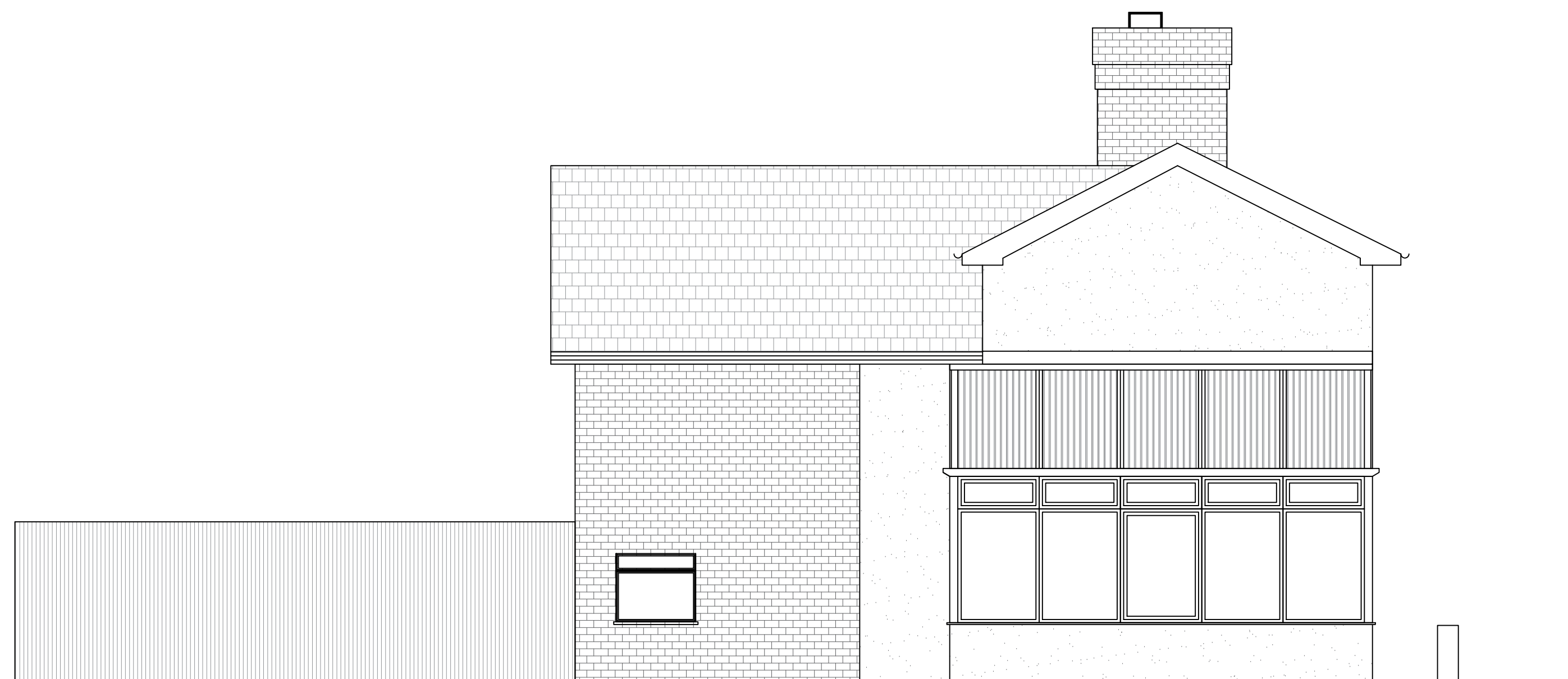
EXISTING NORTH FACING ELEV 1:50