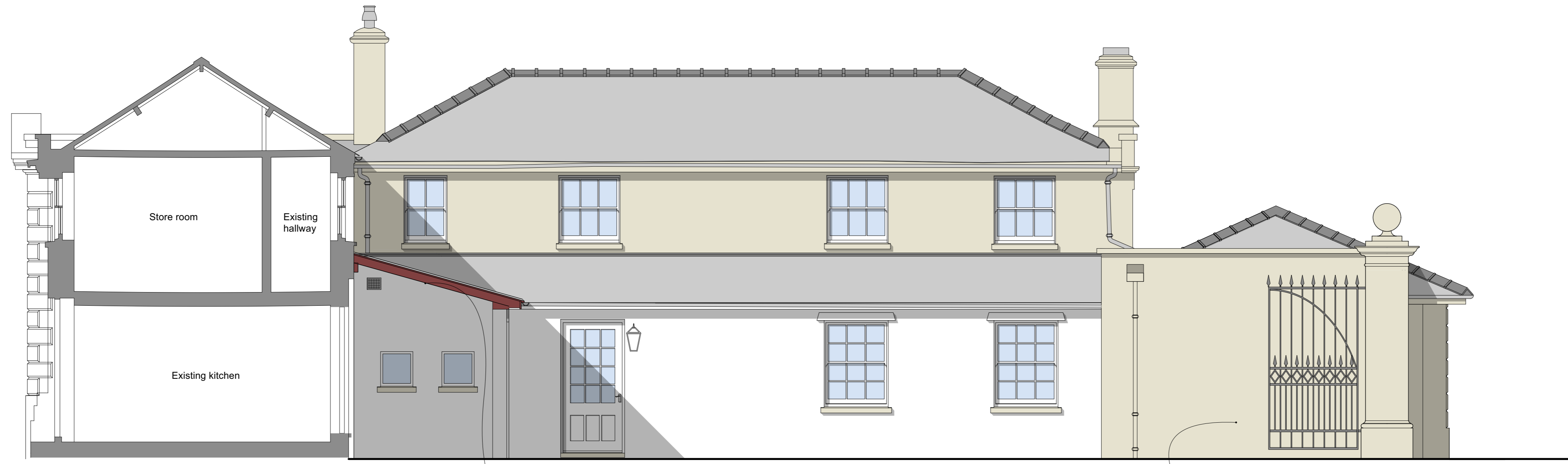
North-East Courtyard Elevation / Section C

General Notes: 1. This drawing is to be read in conjunction with other consultants drawings. 2. Check site conditions prior to commencement of work. 3. Discrepancies must be reported directly to the Architect. 4. Do not scale off drawing, use figured dimensions only, unless for planning purposes. 5. This drawing may be issued in colour, and may be a non-standard paper size.