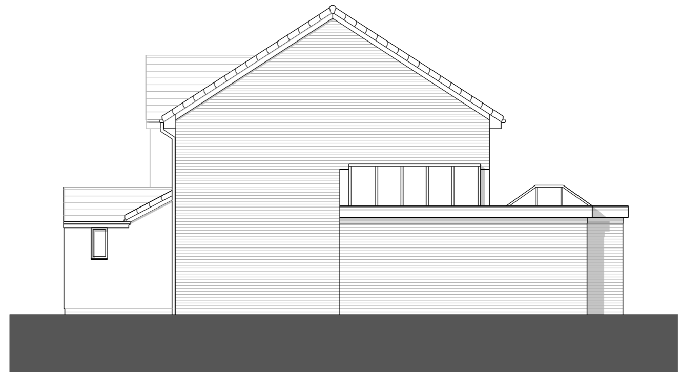
Proposed Side Elevation.

Revision Rev_A_2023.04.30_Roof to kitchen amended.