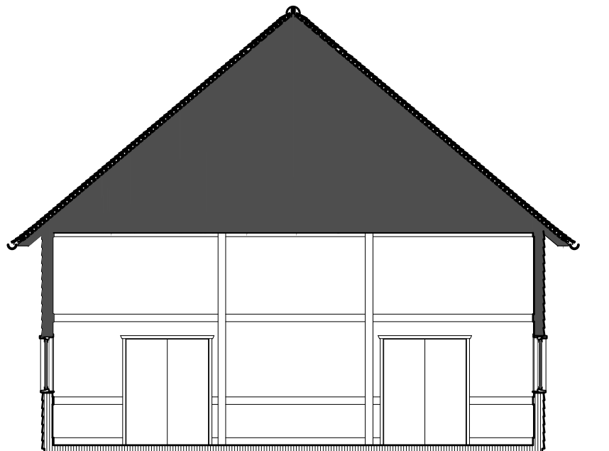
SECTION A - A