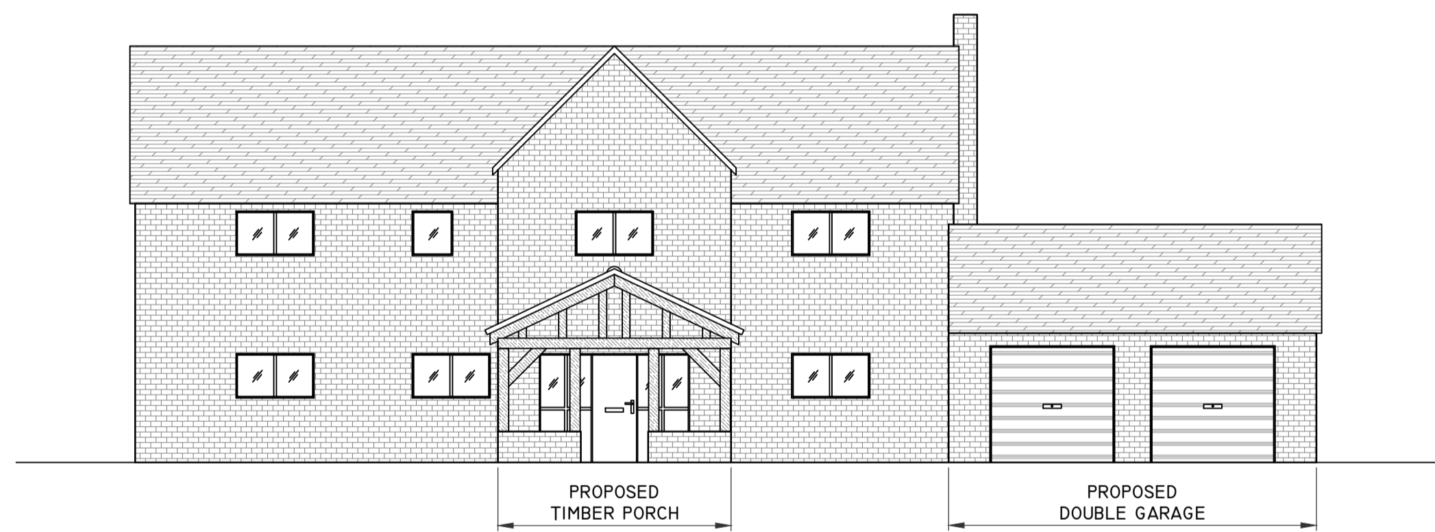
PROPOSED FRONT ELEVATION (1:100)