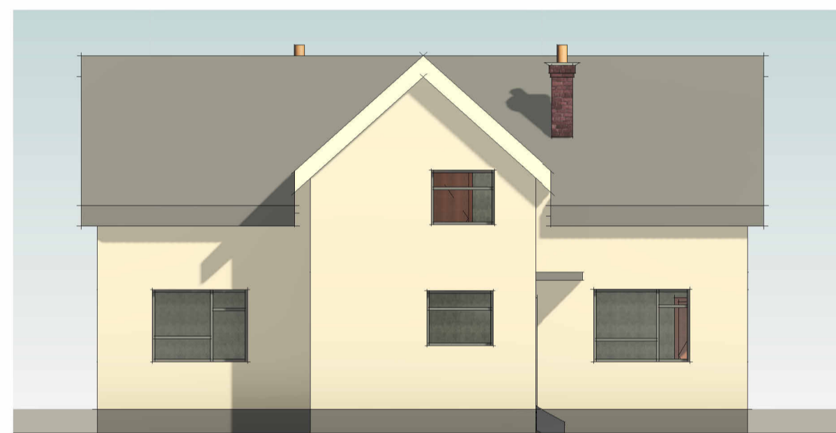
5 Side Elevation 02 01 1 : 100