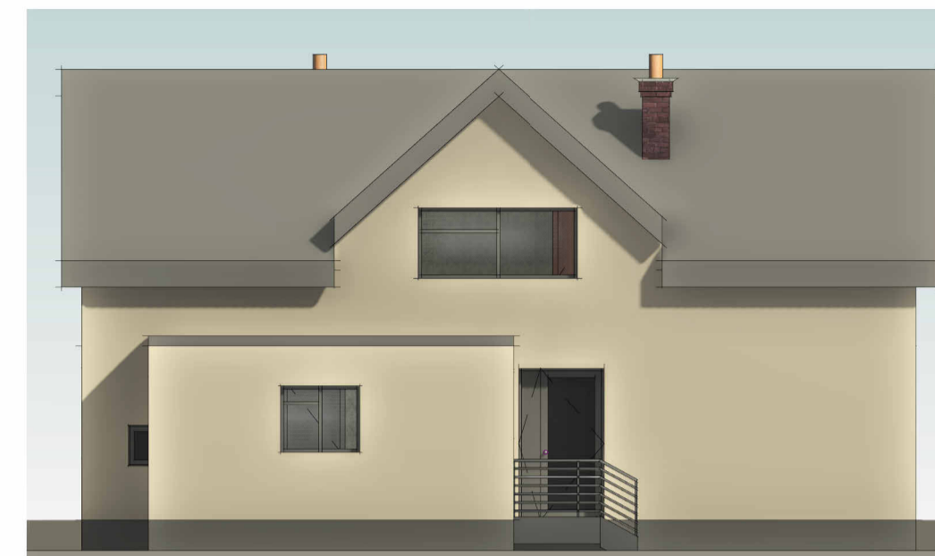
4 Side Elevation 01 01 1 : 100