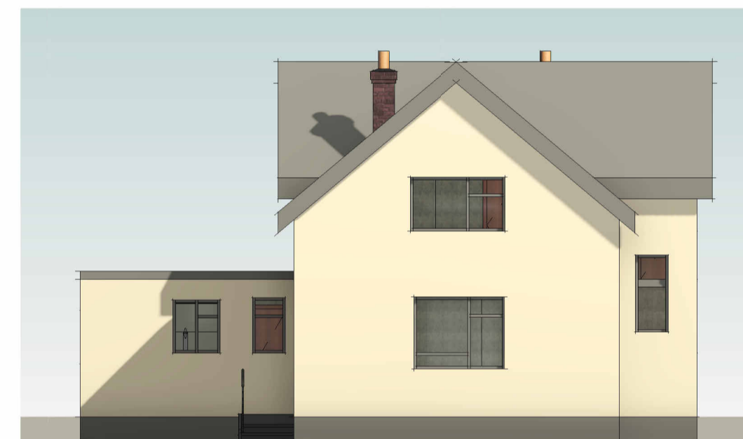
6 Rear Elevation 01 1 : 100