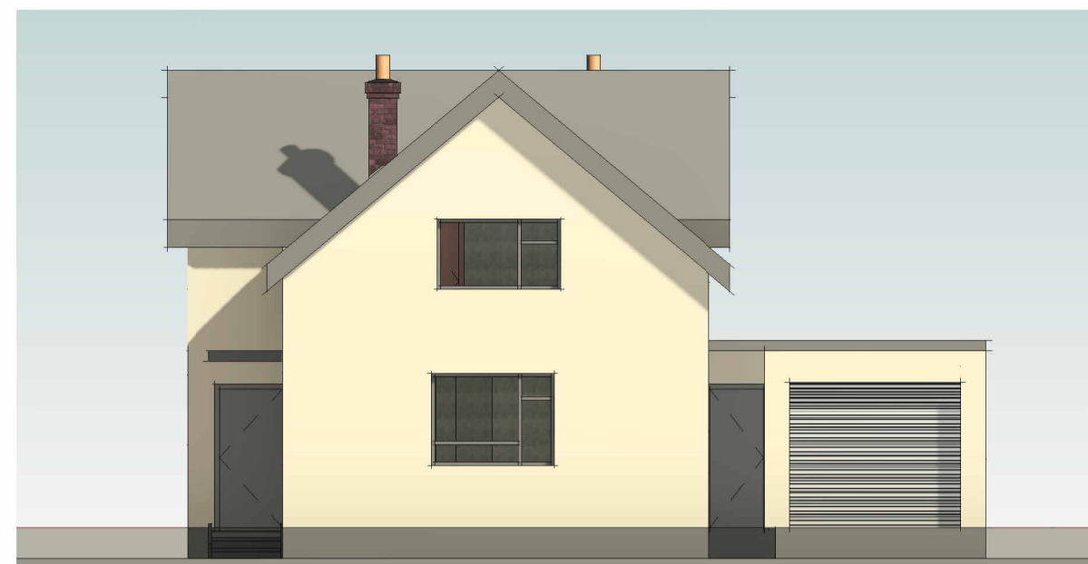
3 Front Elevation 01 1 : 100