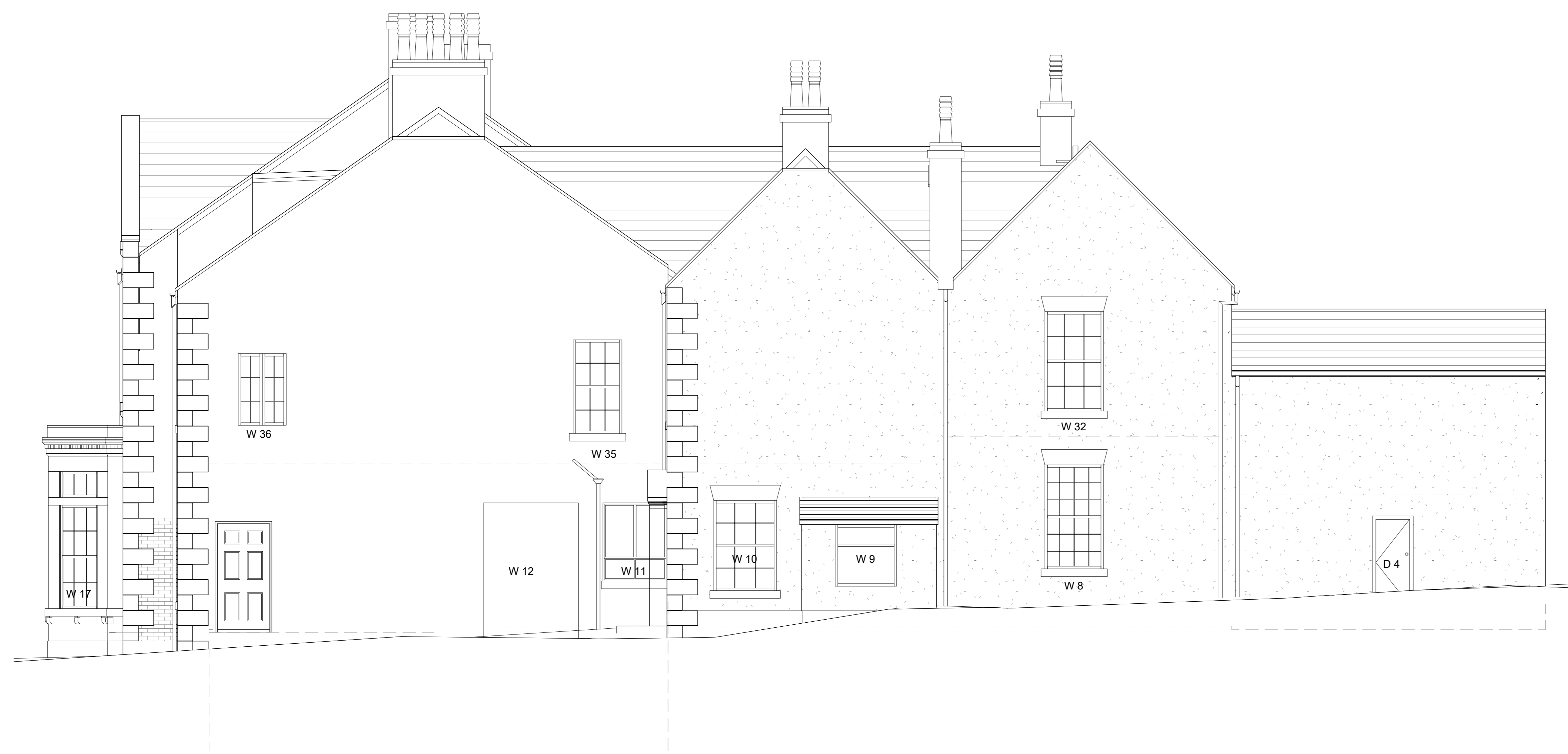
Existing East Elevation