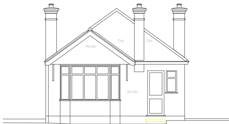
REAR ELEVATION Existing