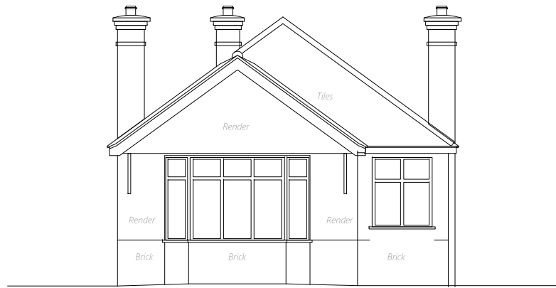
FRONT ELEVATION Existing