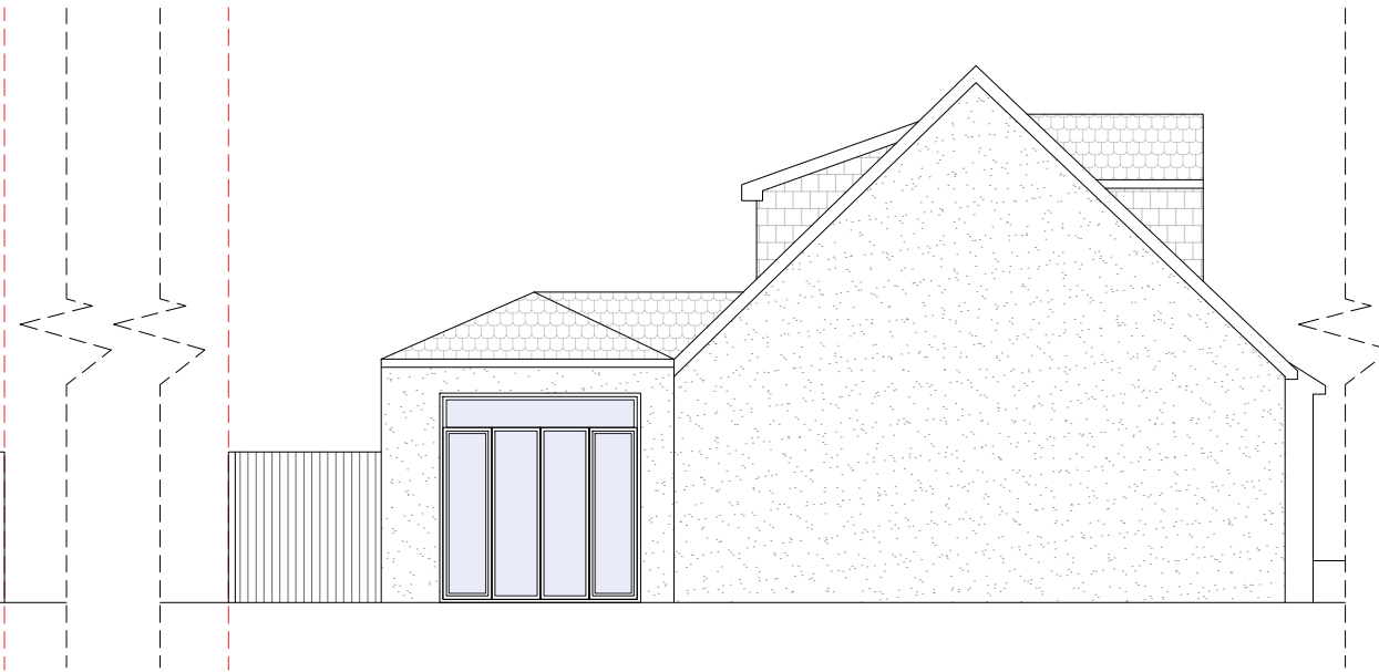
As Approved West Elevation