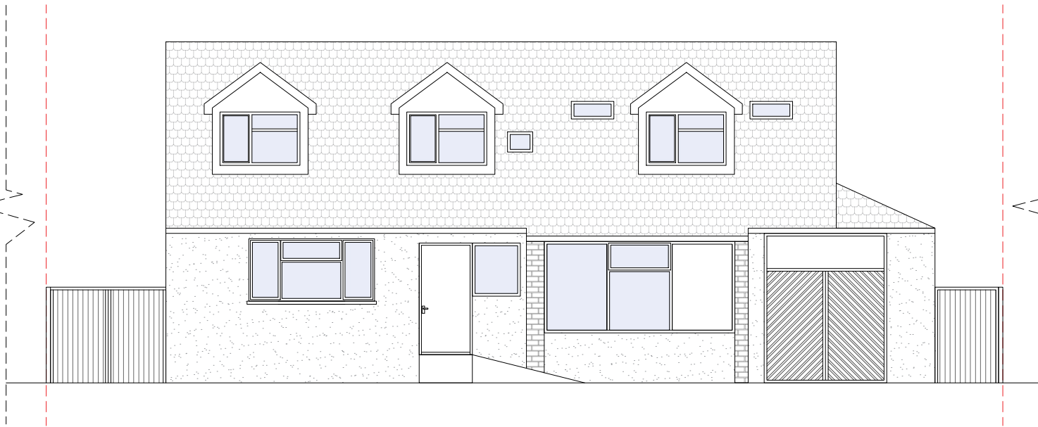
As Approved South Elevation

Block Plans are scaled from the Ordnance Survey Location Maps. Please see the licence number for the Os Maps in the Location Plans