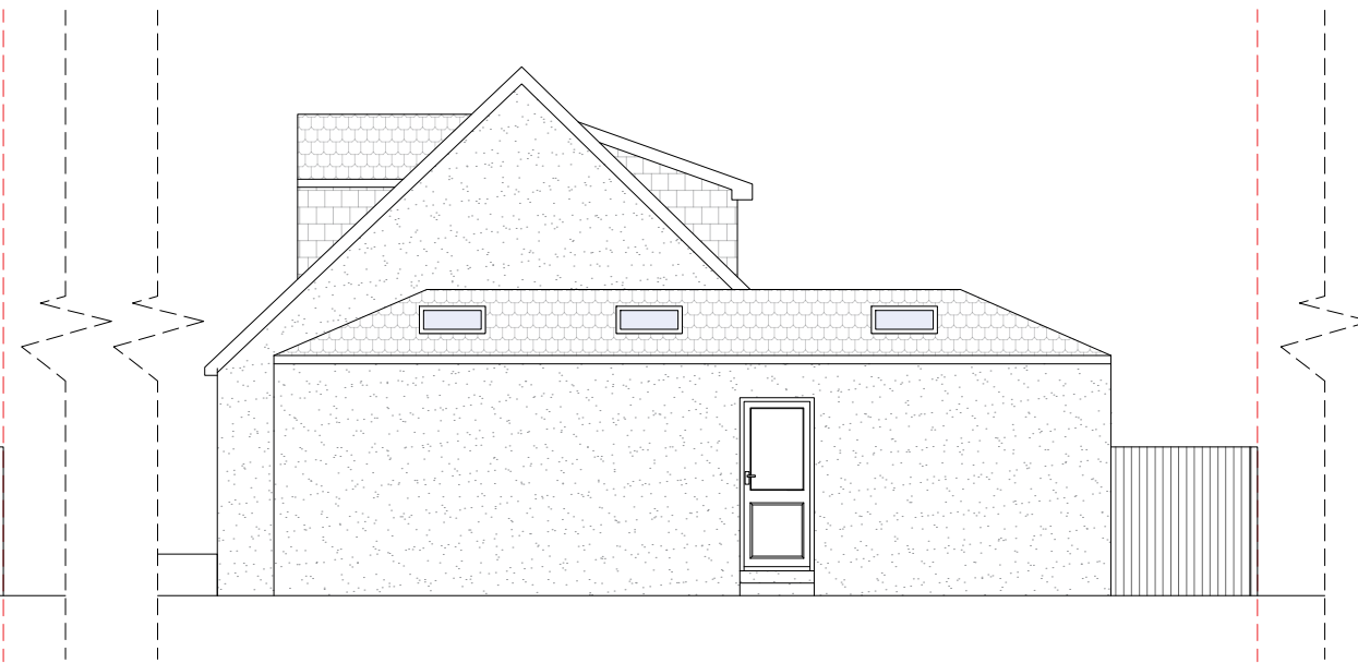
As Approved East Elevation