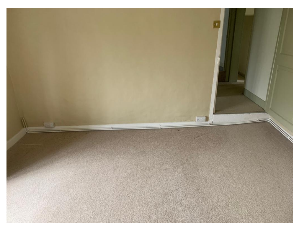
03. Bedroom 2 Existing