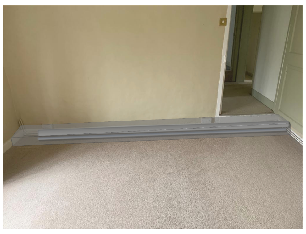
04. Bedroom 2 Proposed - Pipework to run at floor level and boxed in. Existing step to be extended.