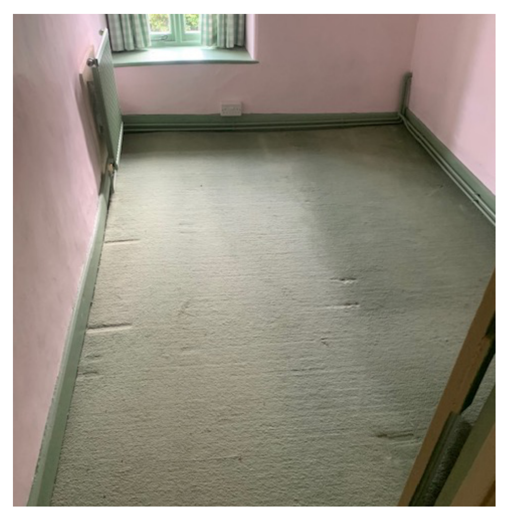
02. Bedroom 5 - Existing radiator to be replaced with a heated tower rail