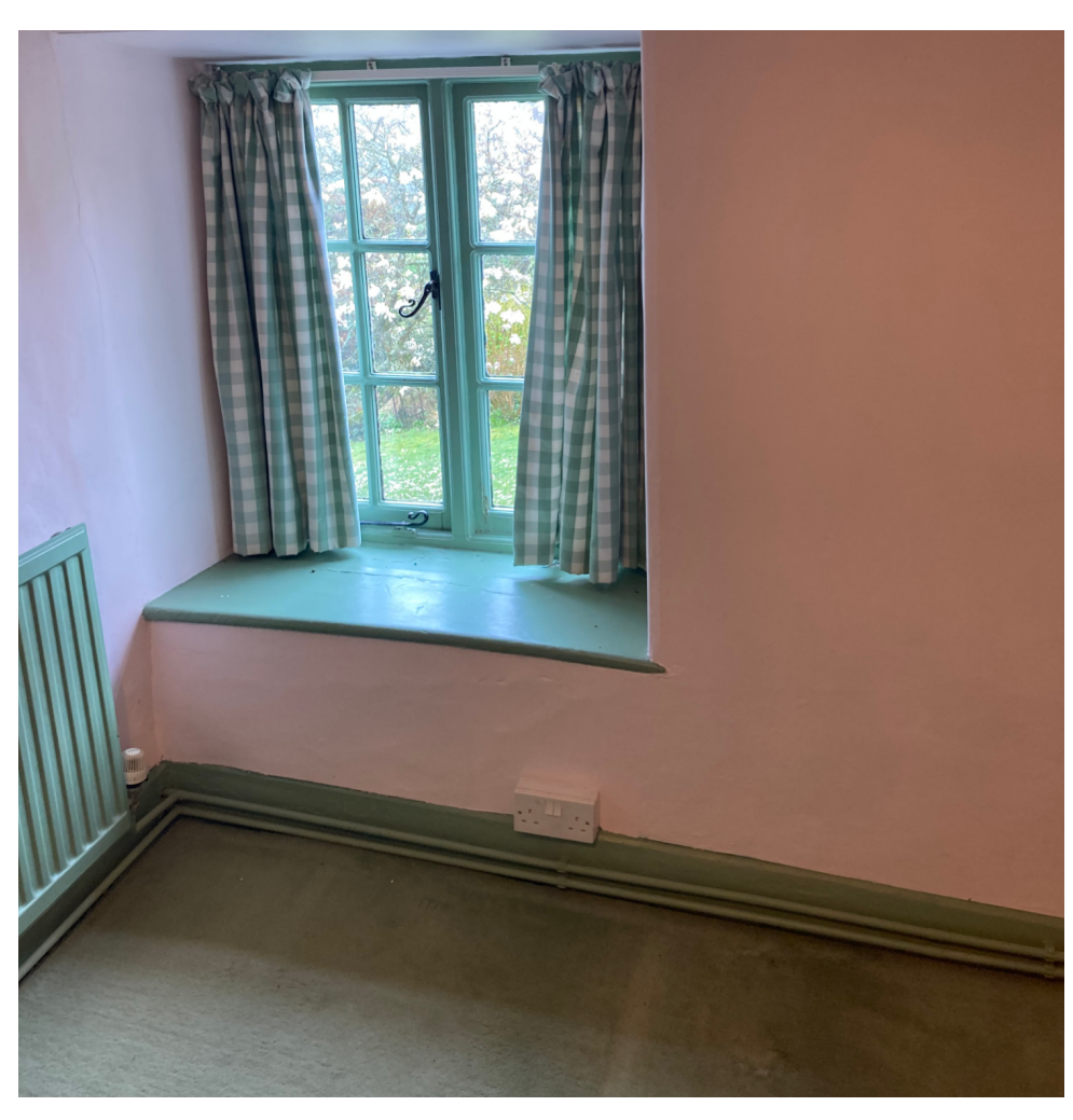
01. Bedroom 5 - Existing bedroom to be turned into family bathroom