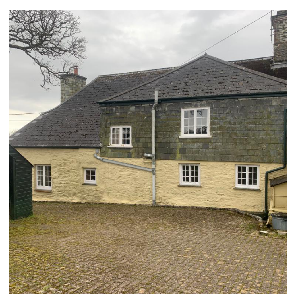
10. Rear Elevation Proposed - New soil pipe existing near current BT connection and joining the existing soil pipe