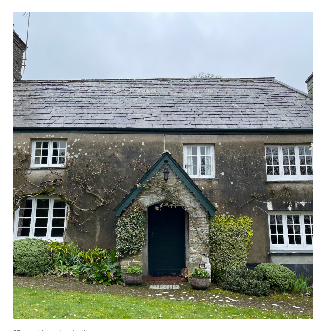
07. Front Elevation Existing