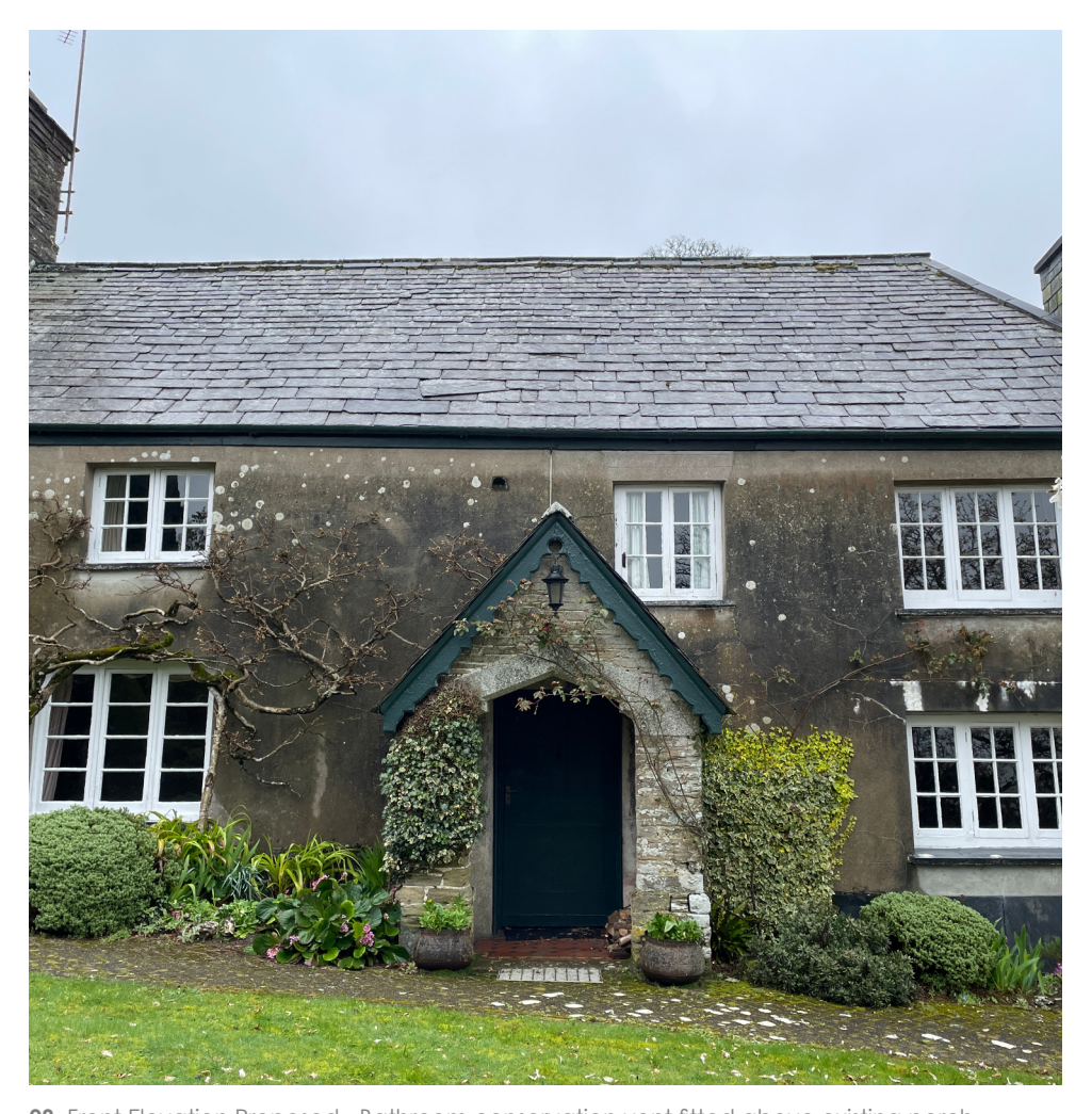
08. Front Elevation Proposed - Bathroom conservation vent fitted above existing porch