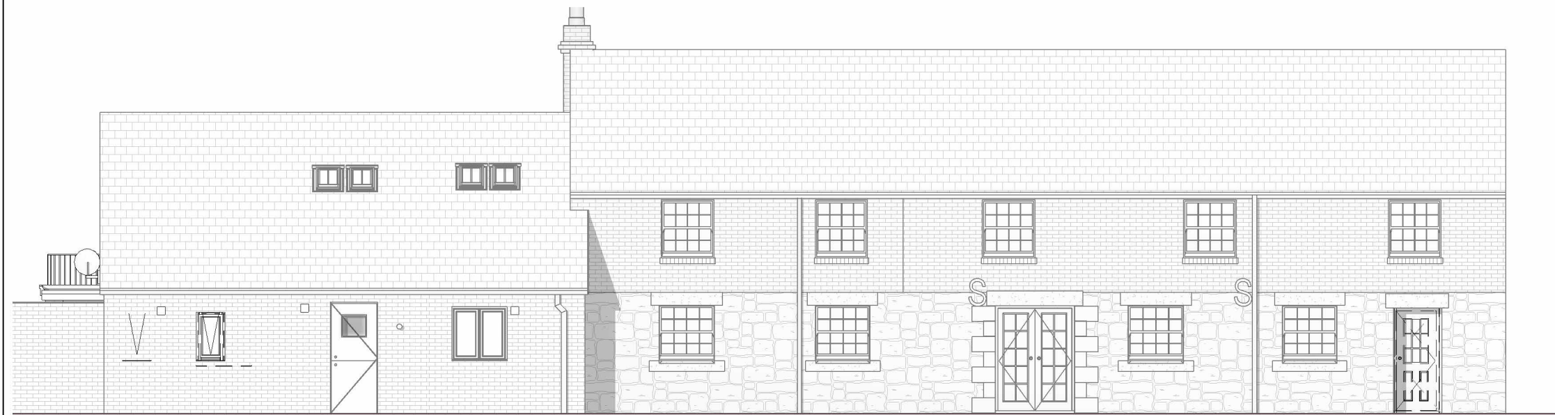
4 Existing Left Elevation 04.A3 1 : 100