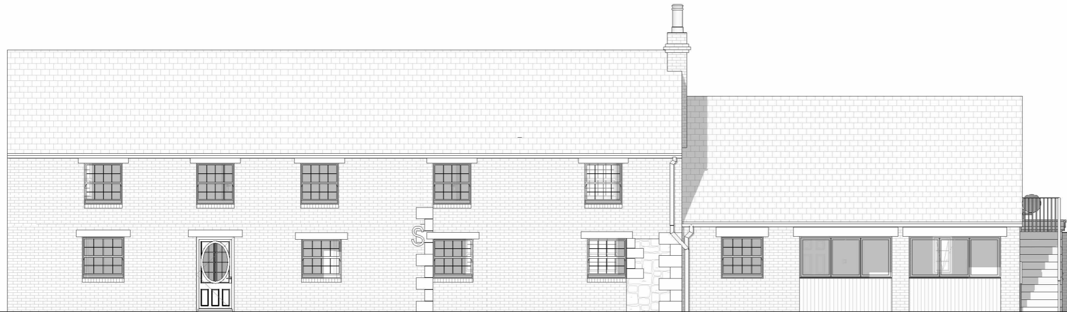
1 08.A3 Proposed Front Elevation 1 : 100