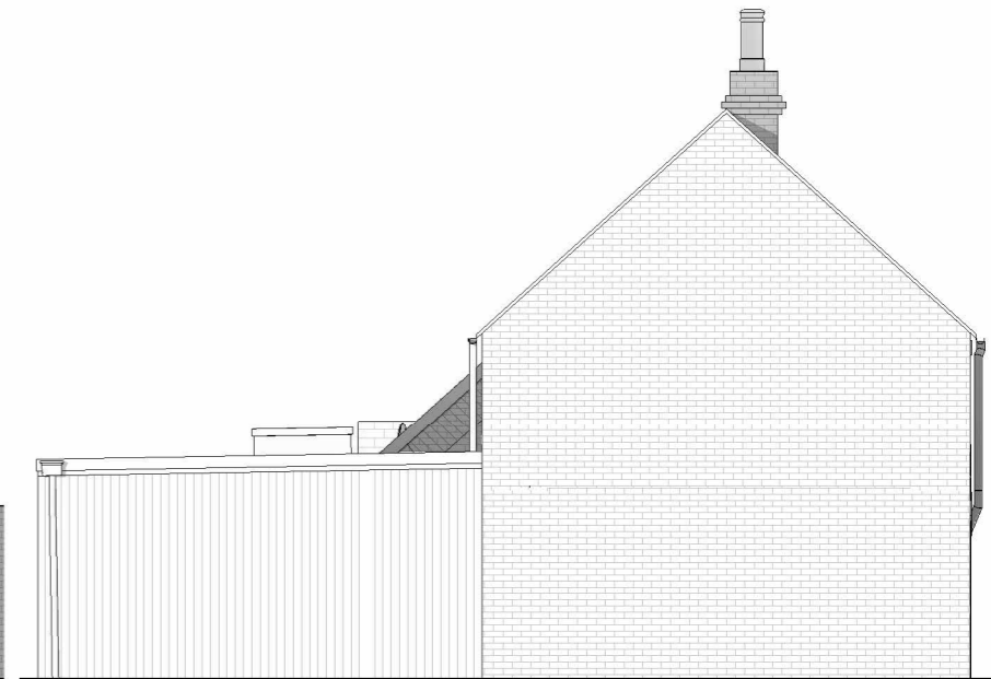
4 08.A3 Proposed Left Elevation 1 : 100