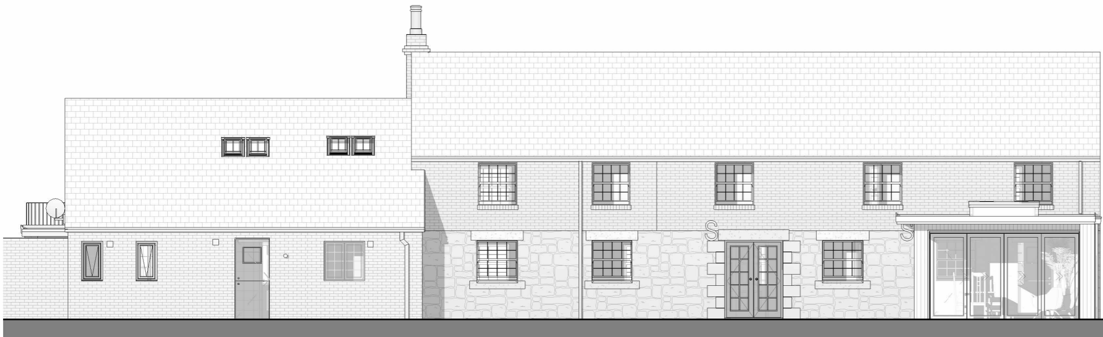
2 08.A3 Proposed Rear Elevation 1 : 100