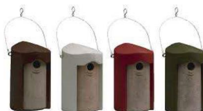
Schwegler 1B standard nest boxes