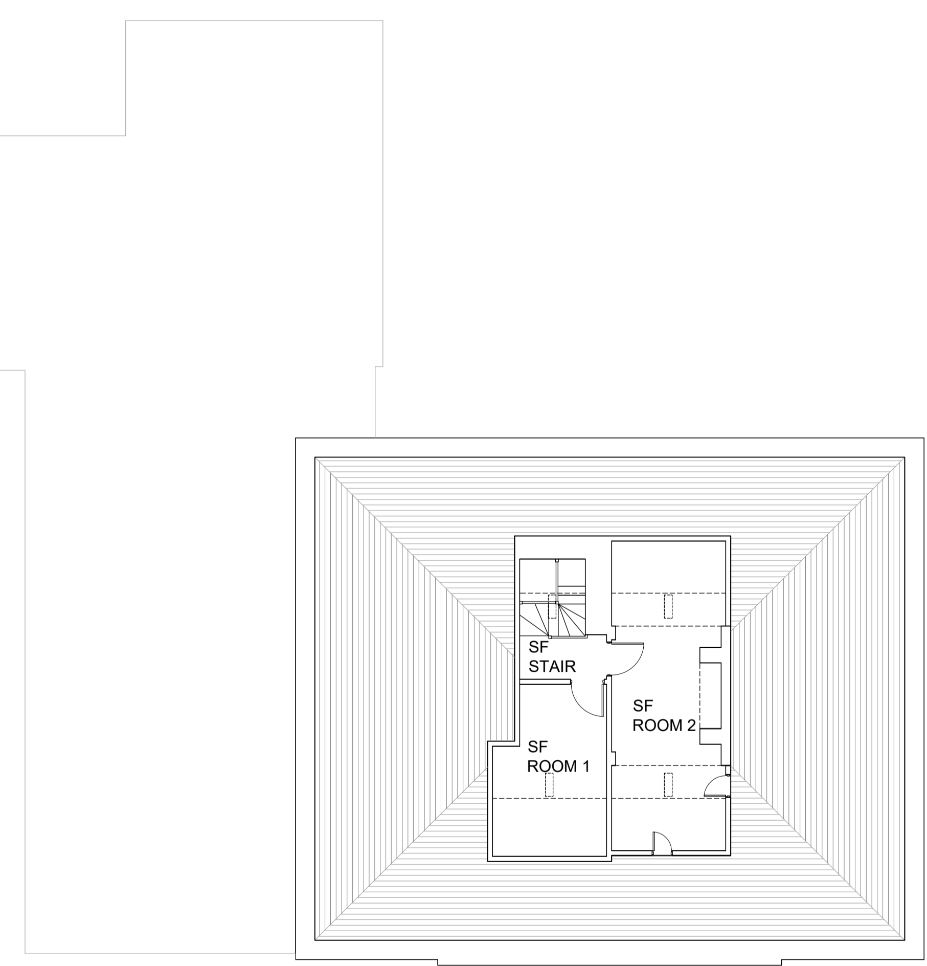
PREVIOUS CONSENT SECOND FLOOR PLAN 1:100