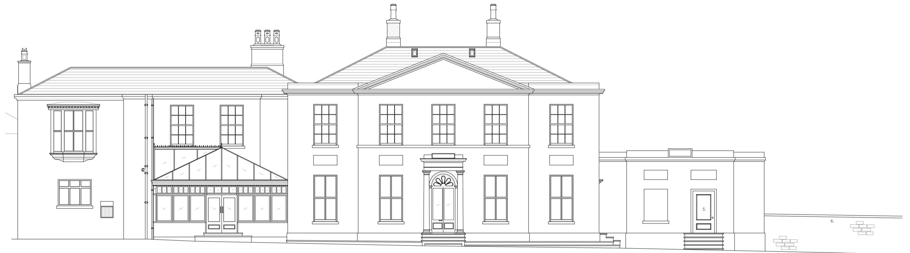
CONSENTED SOUTH EAST ELEVATION