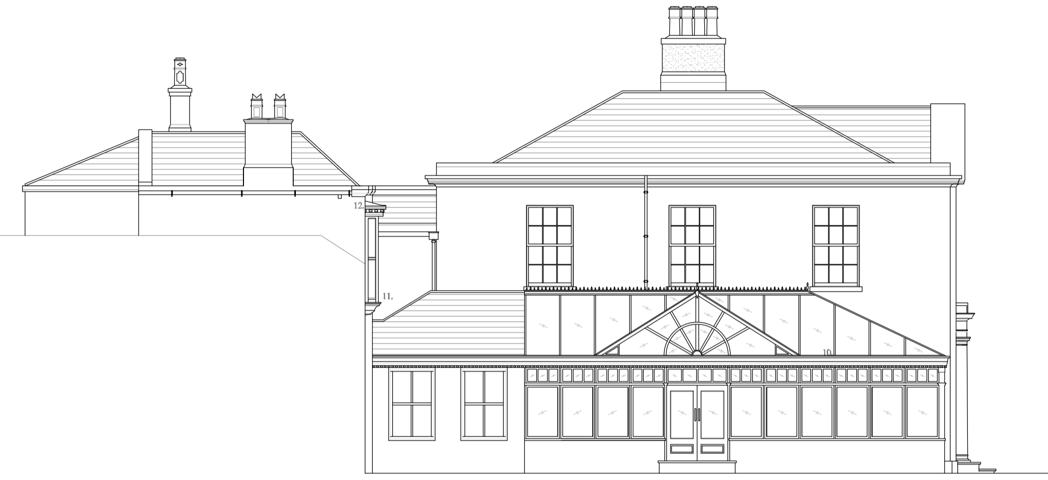
CONSENTED SOUTH WEST ELEVATION