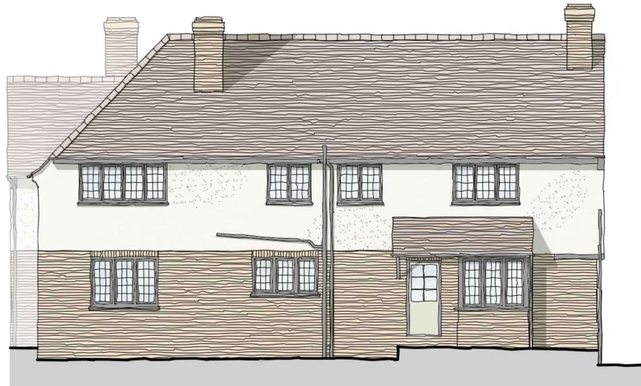
Rear E Elevation 1:100