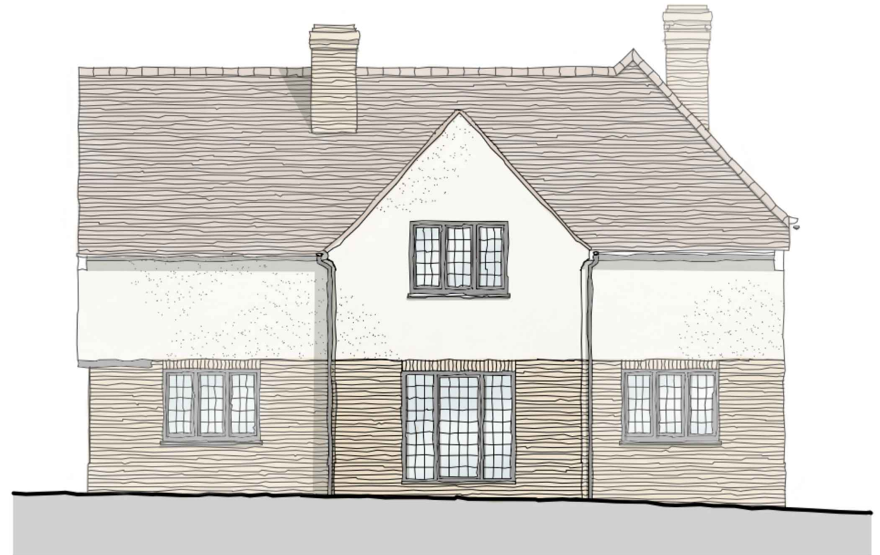
Side S Elevation 1:100