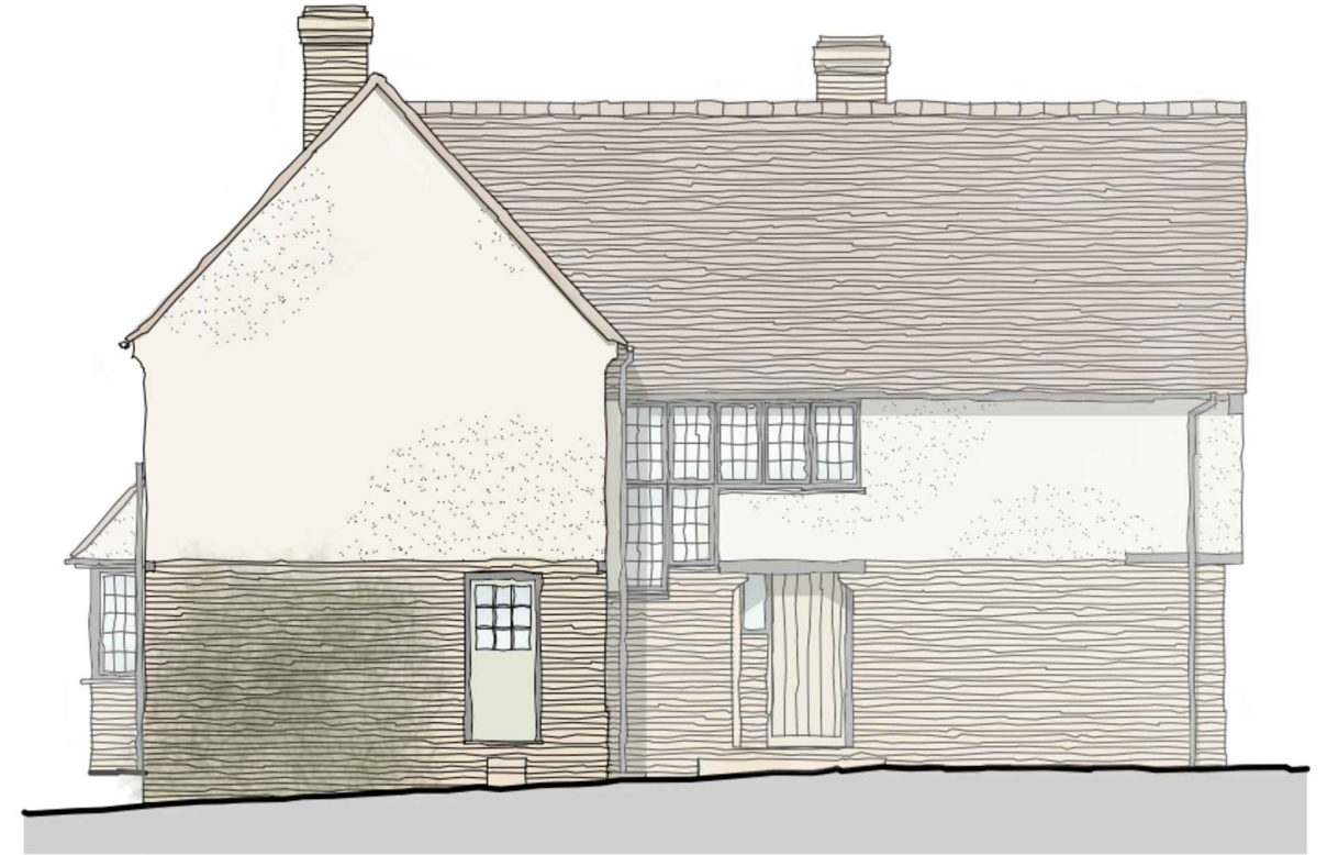
Side N Elevation 1:100