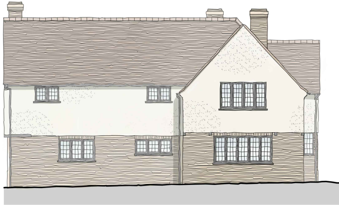
Front w Elevation 1:100