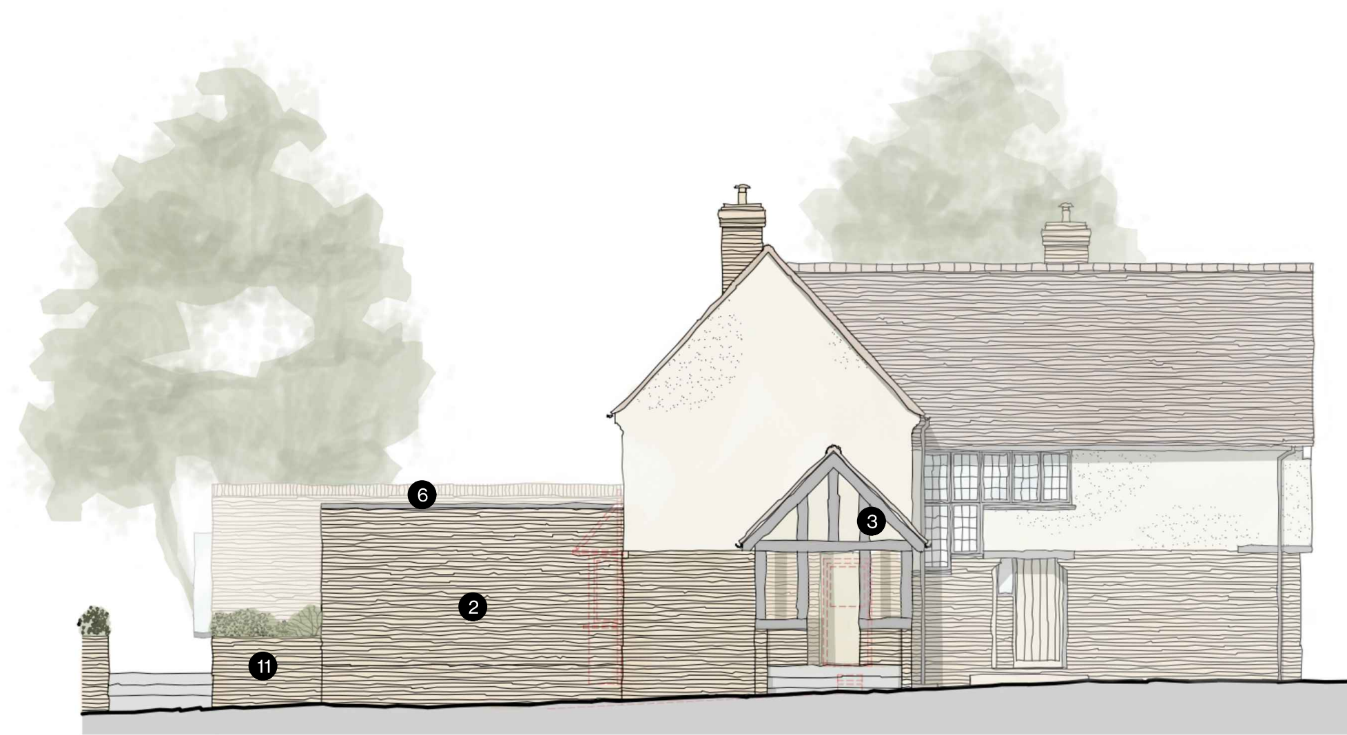
Side N Elevation 1:100