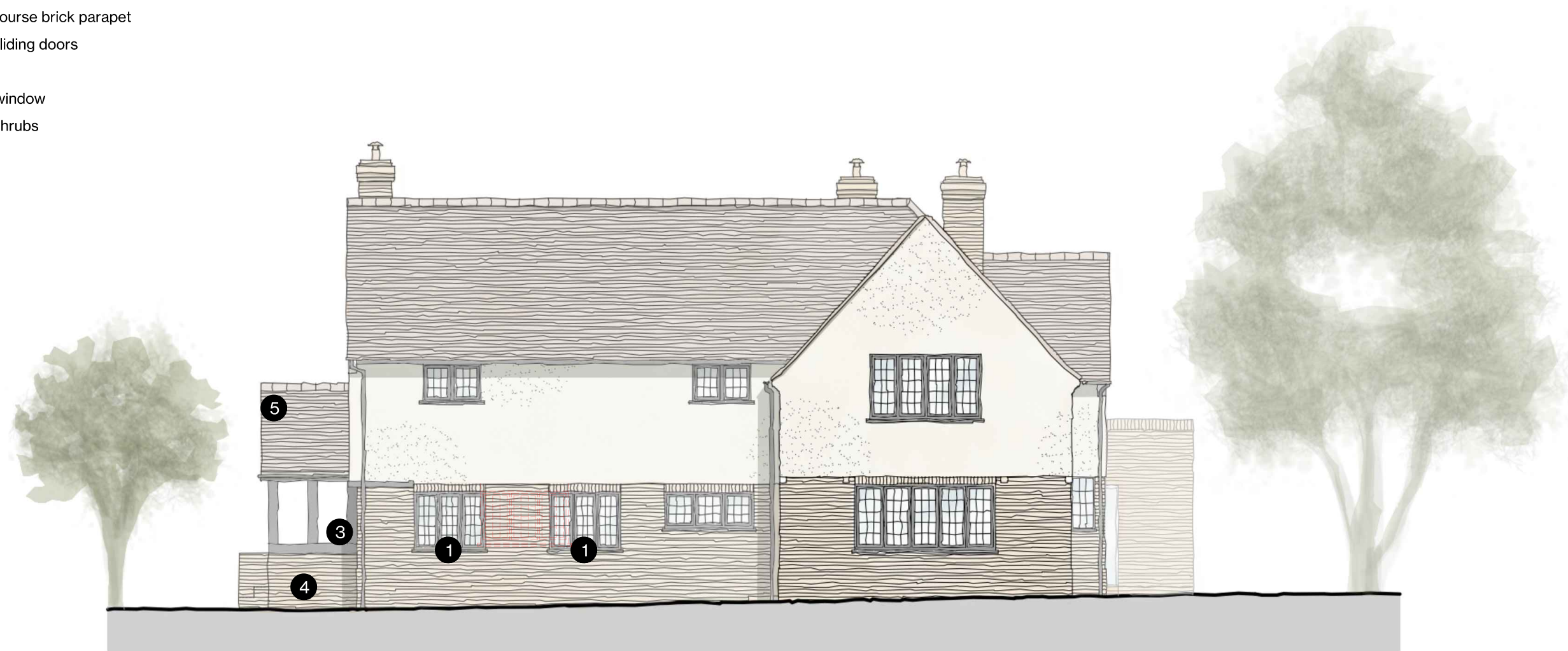
Front w Elevation 1:100