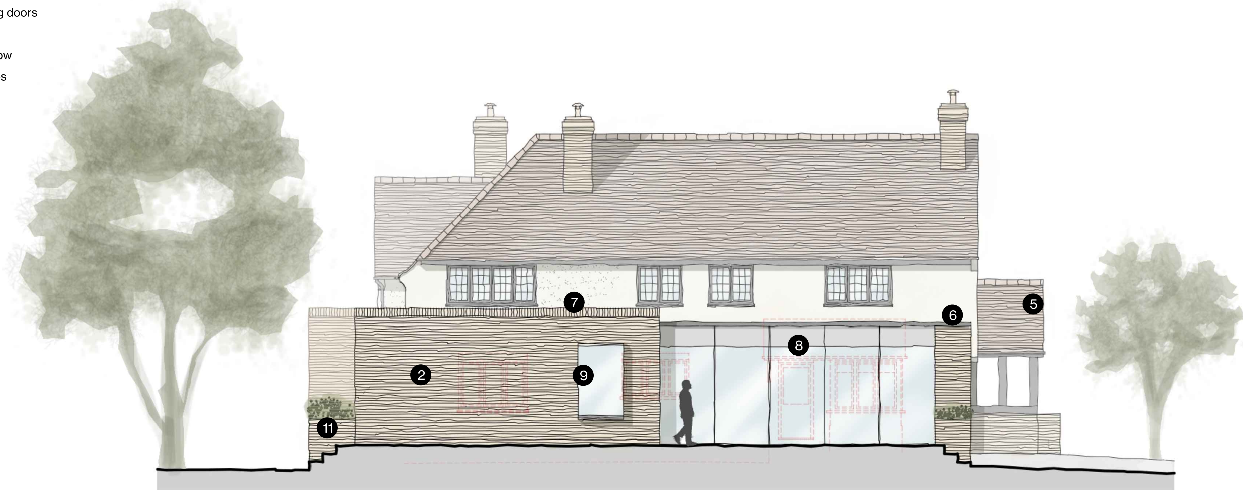
Rear E Elevation 1:100