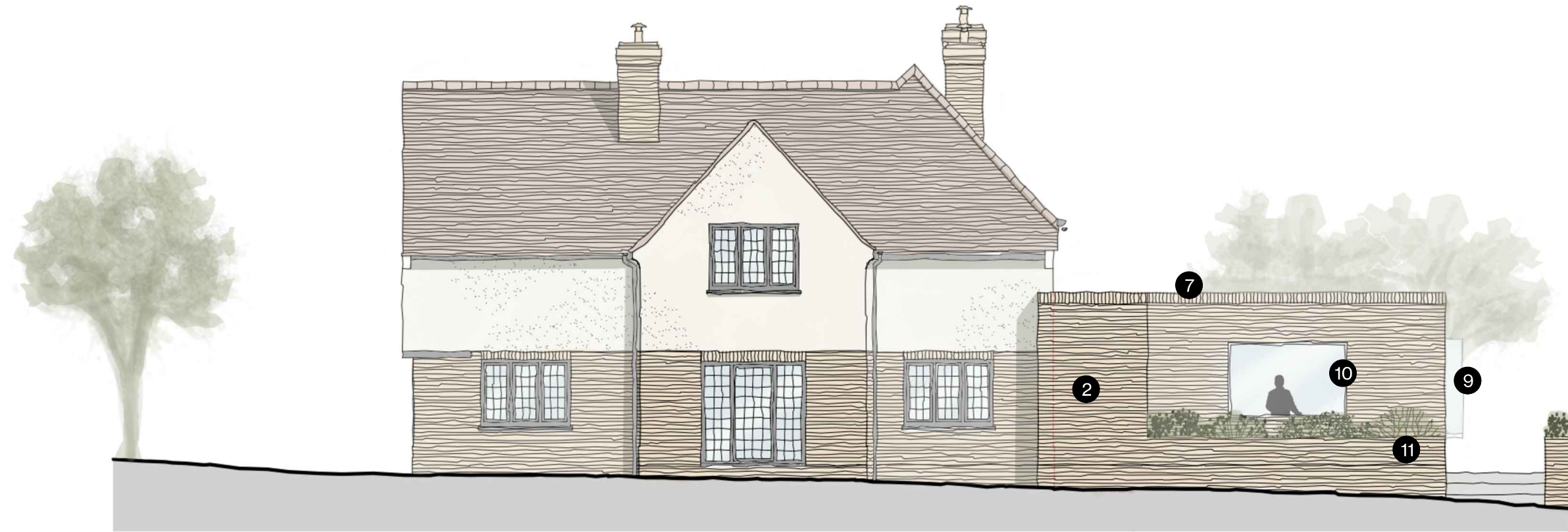
Side s Elevation 1:100