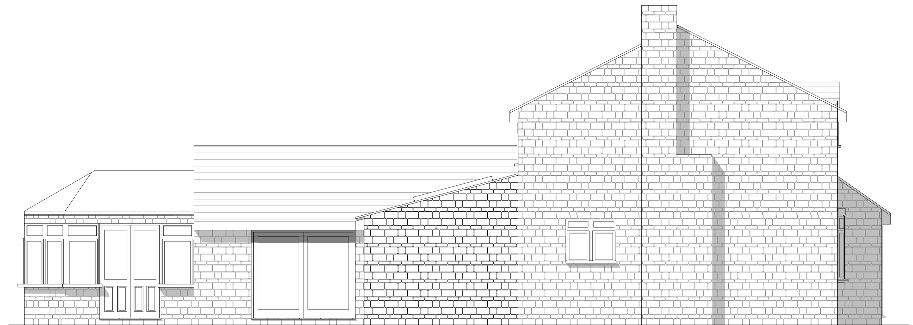
Proposed Side 1 Elevation