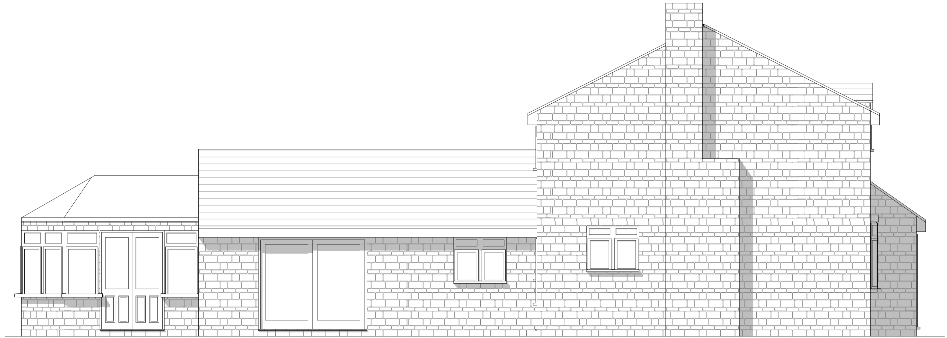
Existing Side 1 Elevation