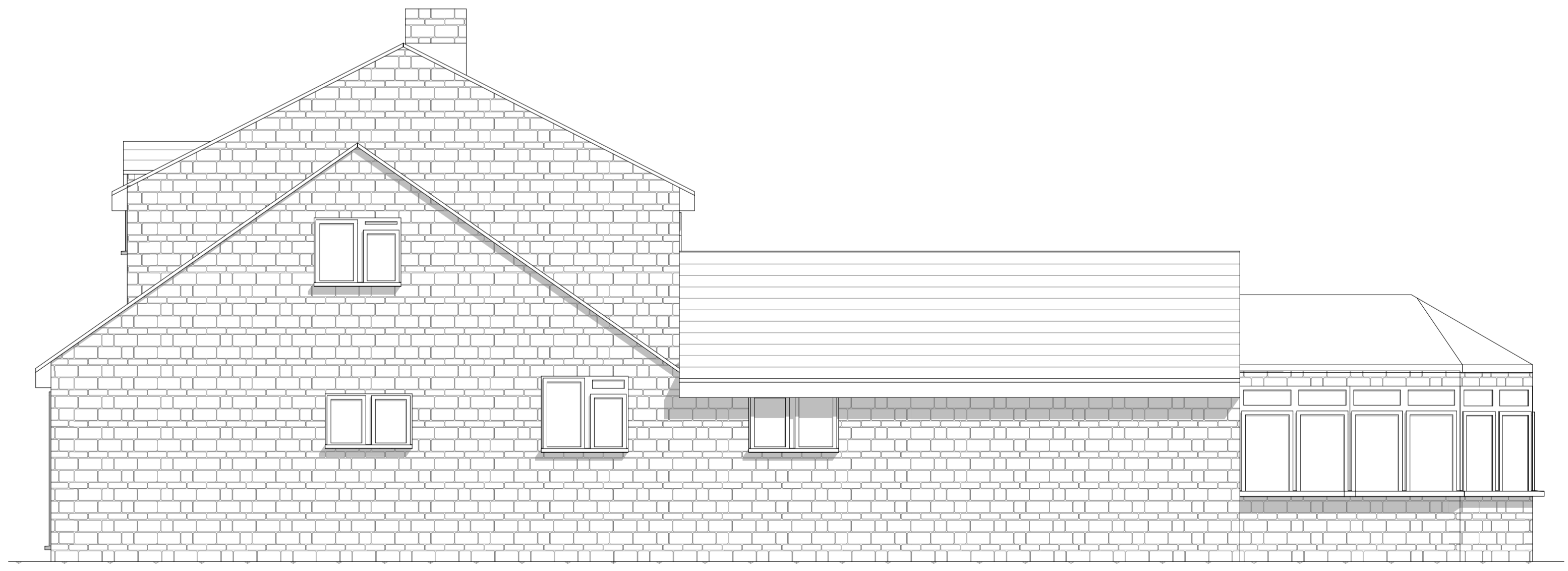
Existing Side 2 Elevation