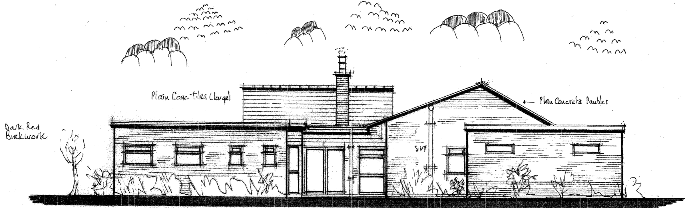
EXISTING SIDE ELEVATION - north