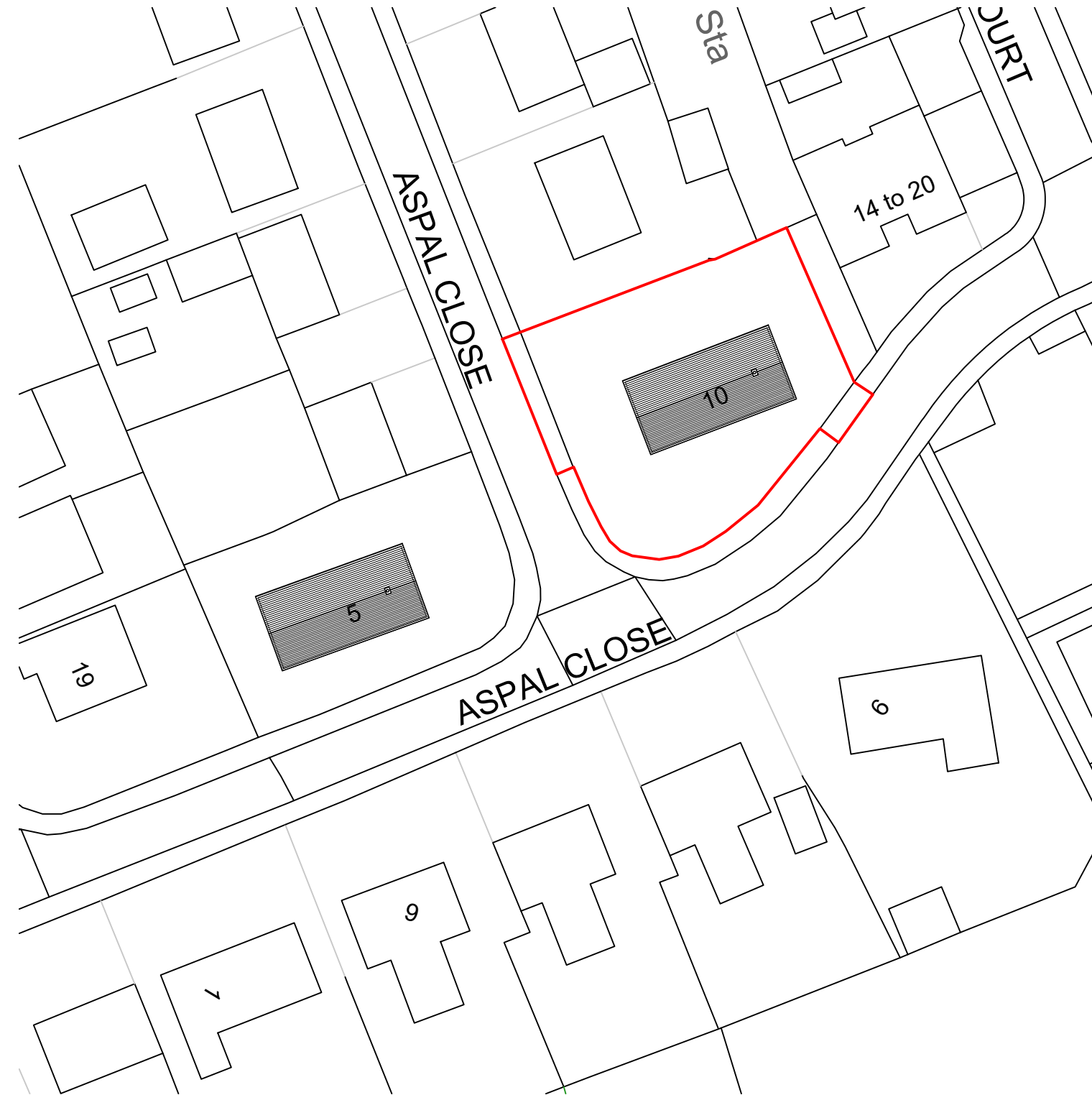
1:500 Existing Site Plan