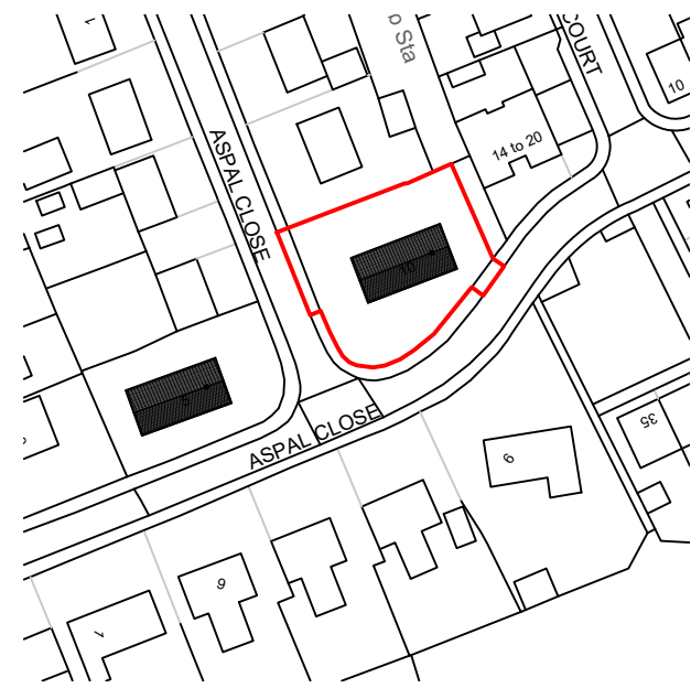
1:1250 Existing Site Plan

TAB Architecture Ltd Unit 13 E-Space South, 26 St Thomas Place, Ely, Cambridgeshire, CB7 4EX email: info@tabarchitecture.co.uk tel: 01638 505365