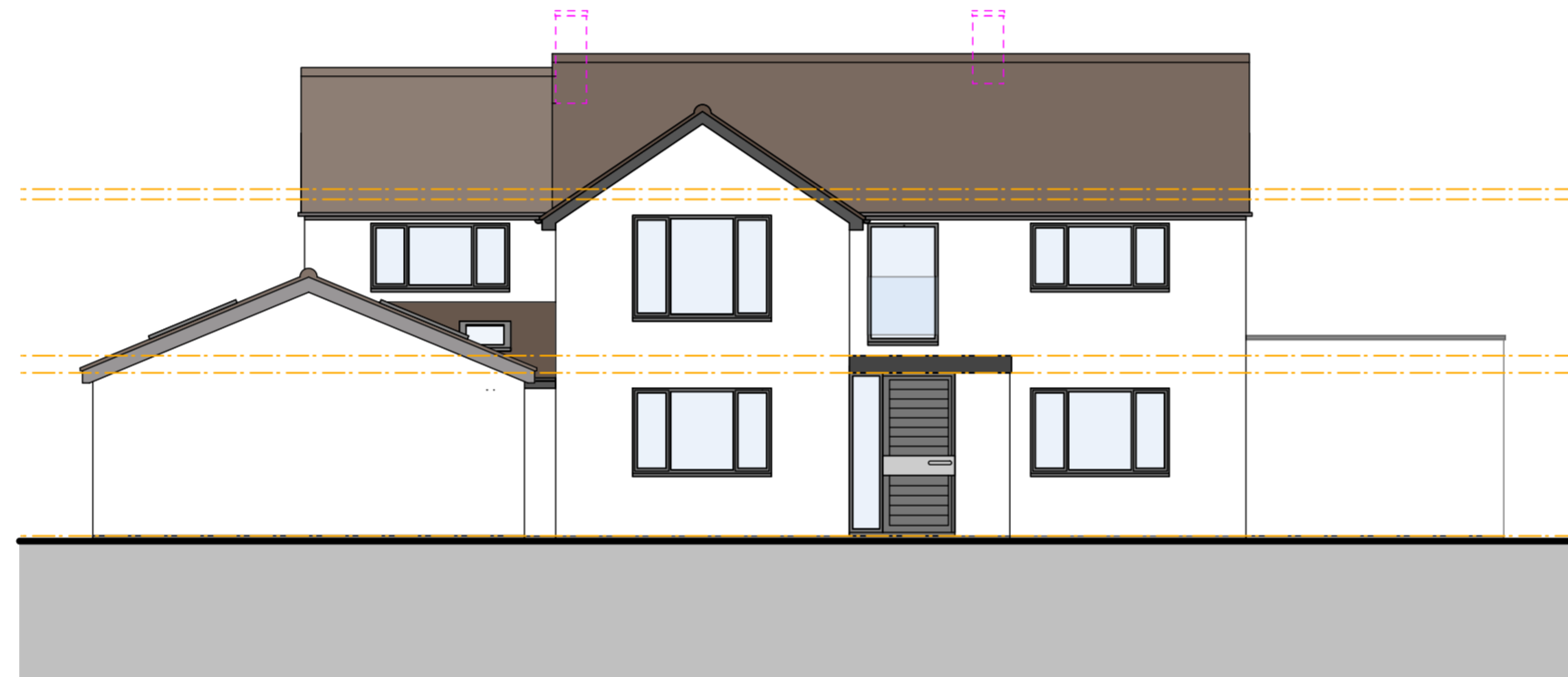
South West Elevation (Front - Garage Removed)