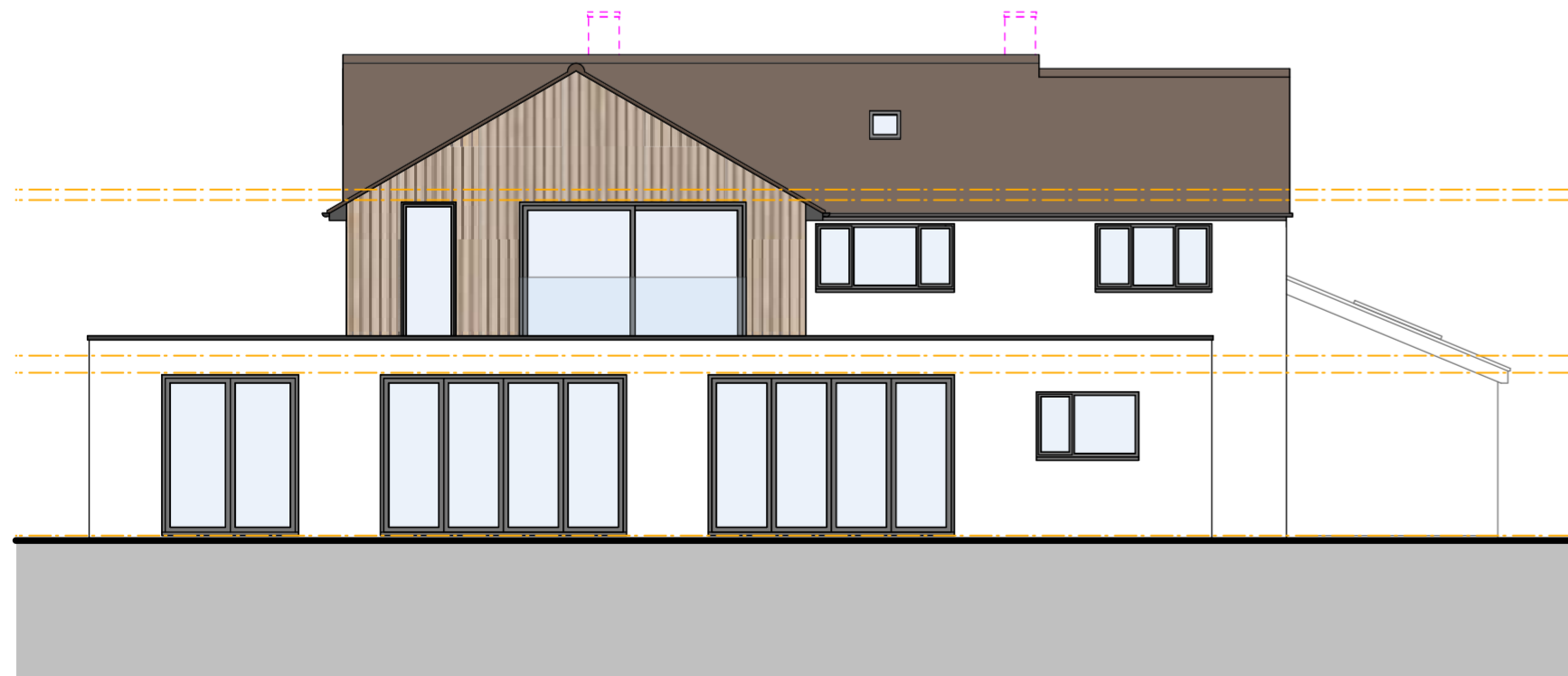
North East Elevation (Rear)