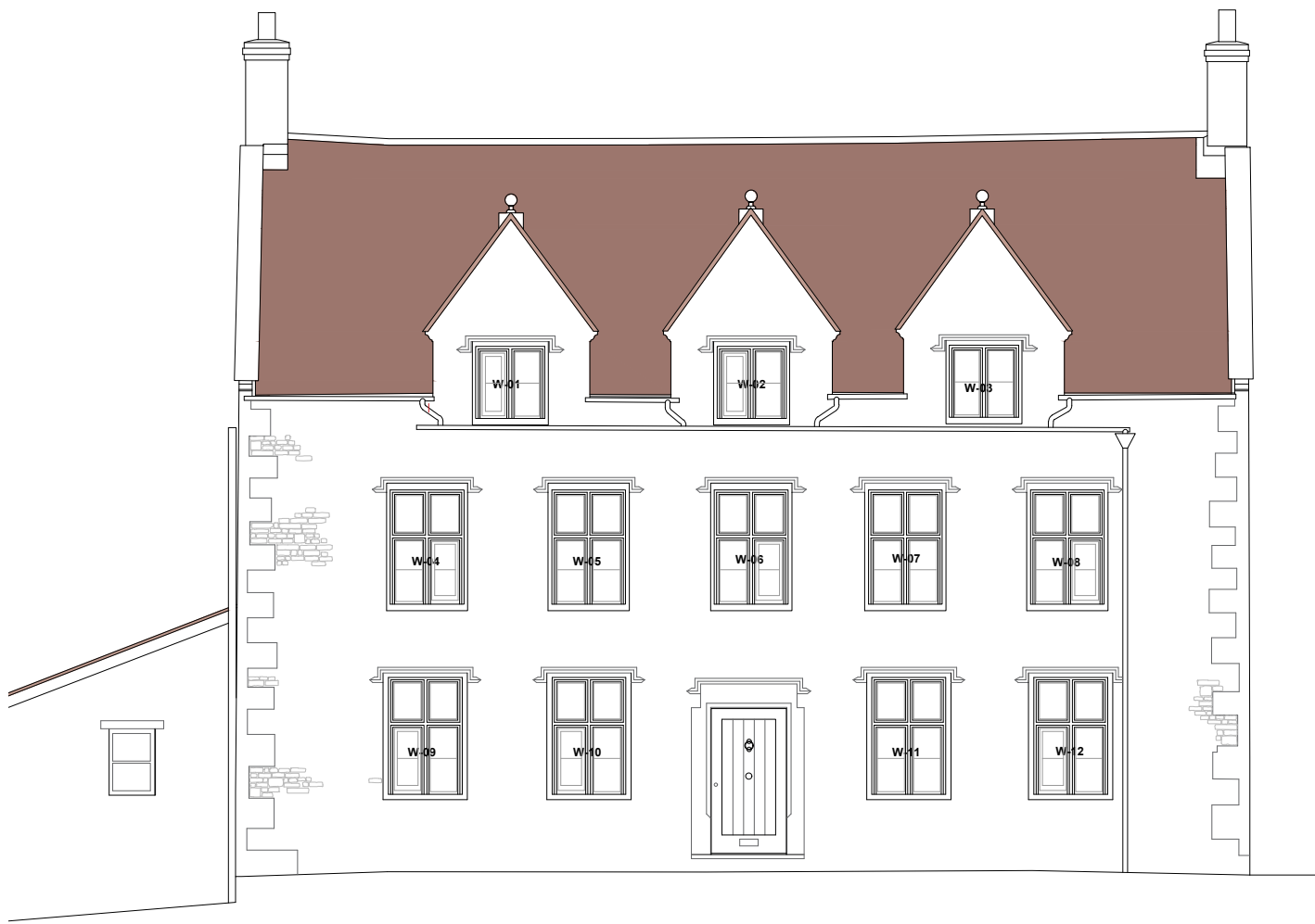
01 PRINCIPLE ELEVATION (WITHIN GARDEN - FACING SOUTH)

W-01 -Original window opening -Original stone Mullions -Non original single glazed plate glass. -Non original single glazed (timber) casement.