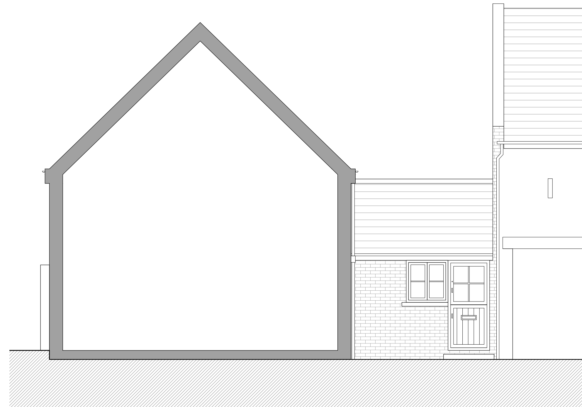
3. South West Elevation