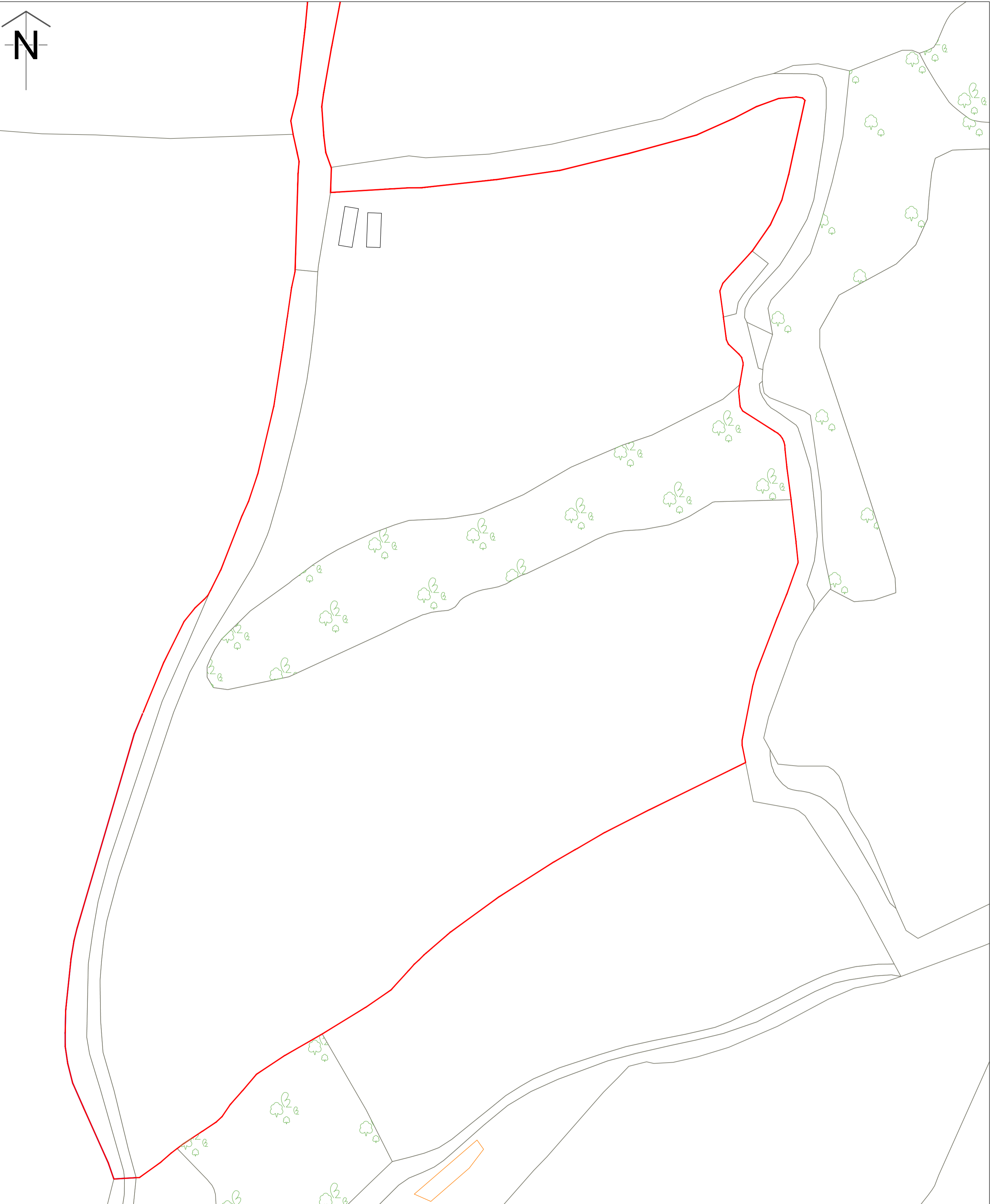
Existing Site Plan 1:500