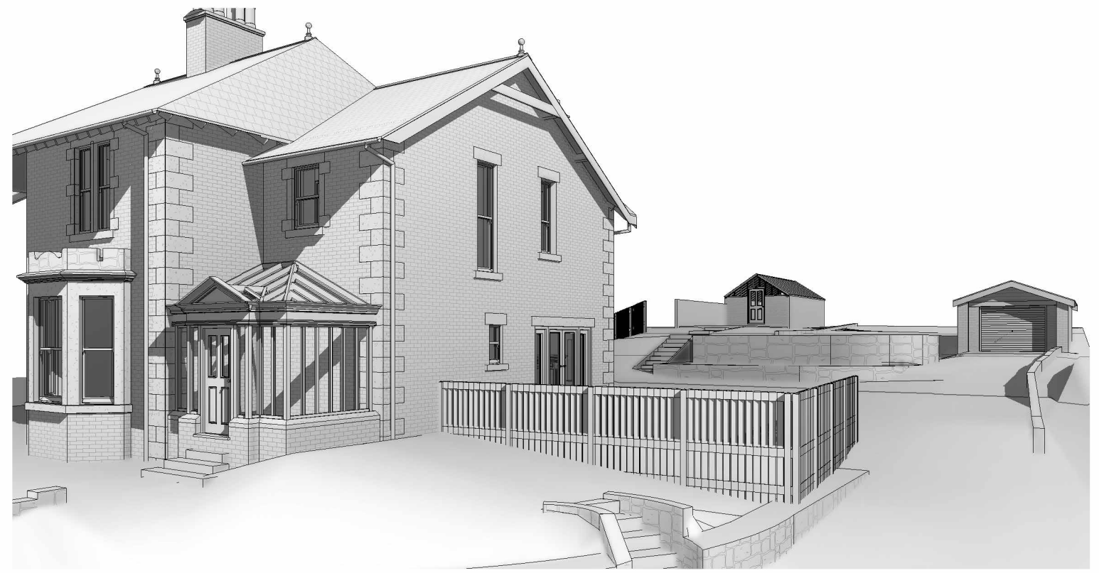
2 3D View 2 12.A3