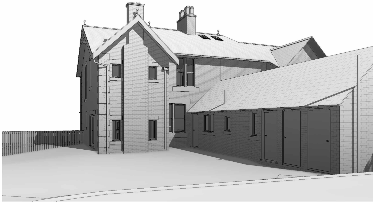
1 3D View 1 12.A3