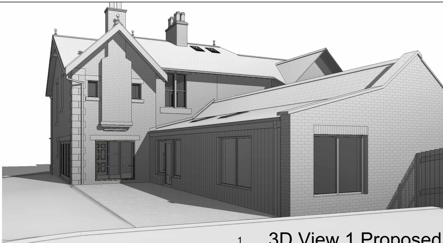
1 3D View 1 Proposed 20.A3