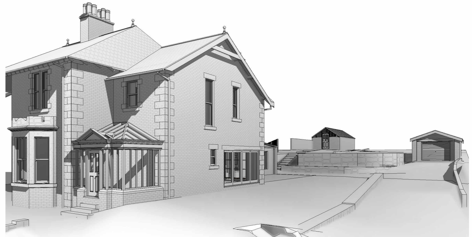
2 3D View 2 Proposed 20.A3 4 3D View 4 Proposed 20.A3