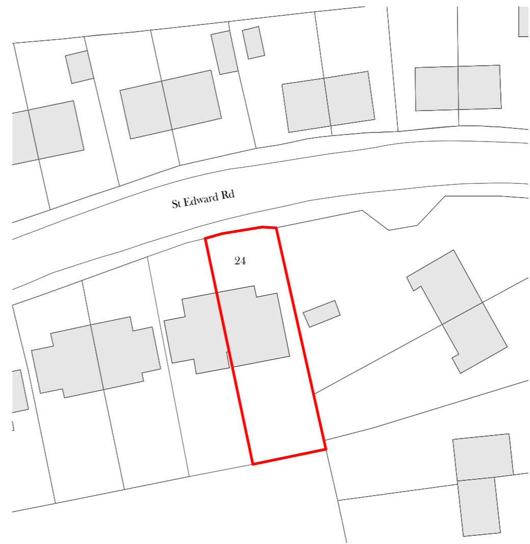
Proposed Site Plan - 1:500