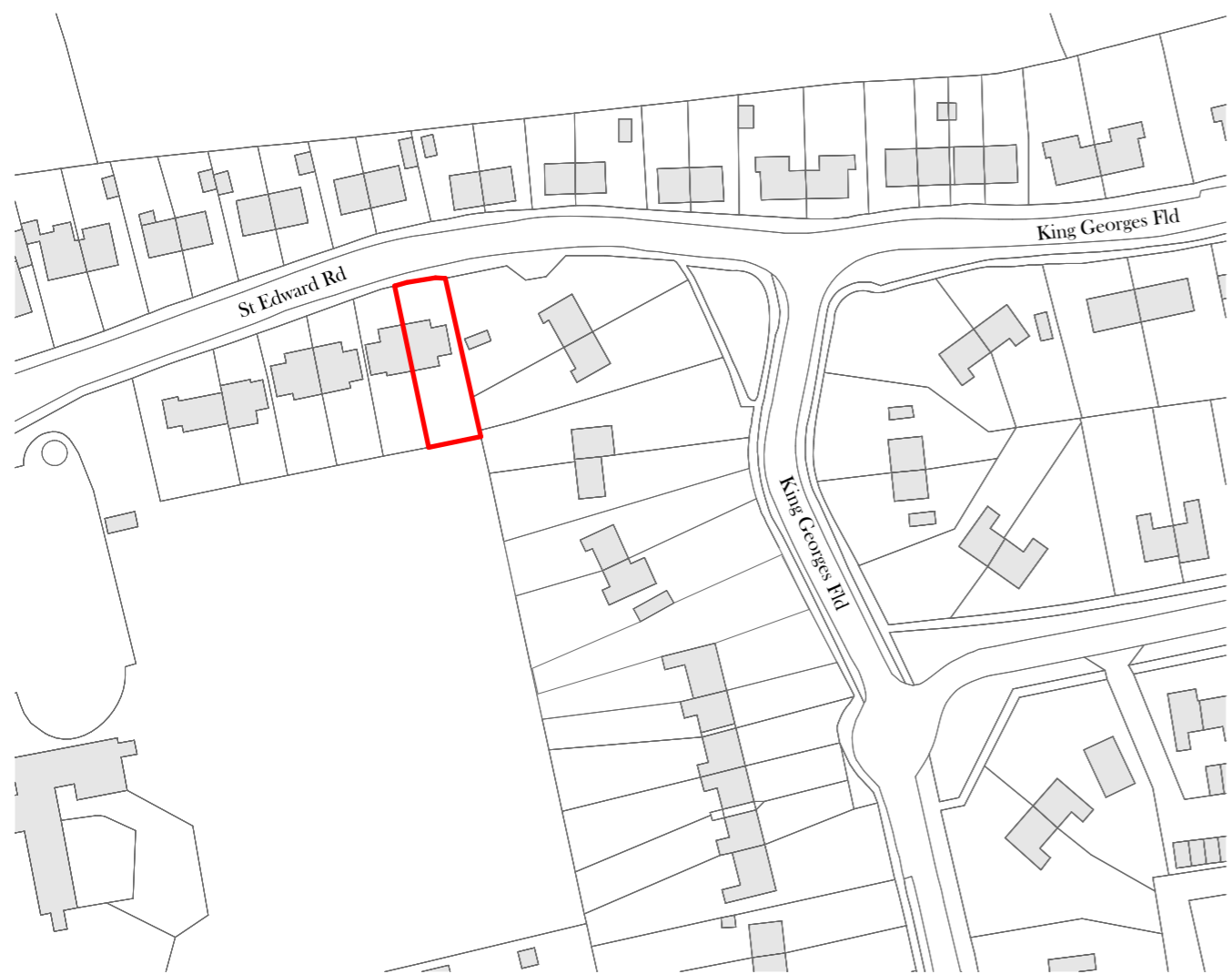
Location Plan - 1:1250