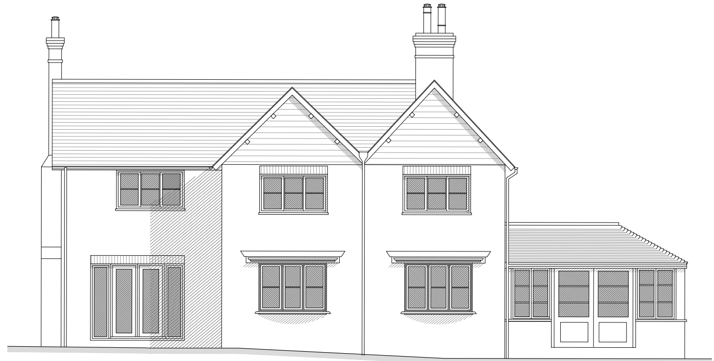
EXISTING SOUTH-WEST ELEVATION