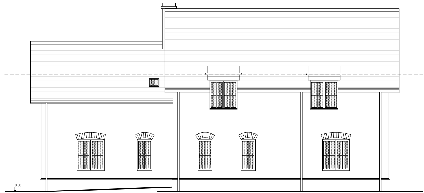
② Existing North (Side) Elevation. 1:100