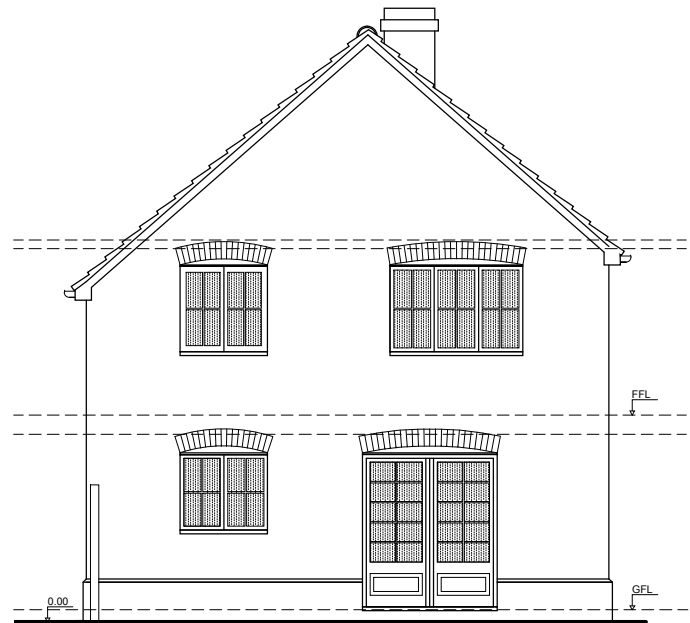
③ Existing West (Rear) Elevation. 1:100