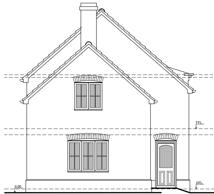
① Existing East (Front) Elevation. 1:100