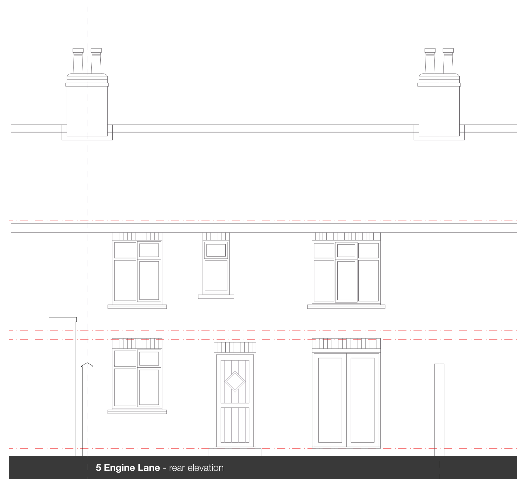
5 Engine Lane - rear elevation