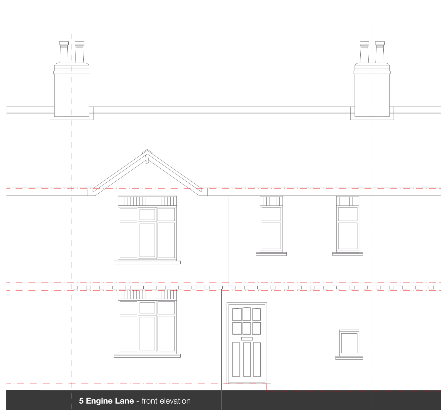
5 Engine Lane - front elevation