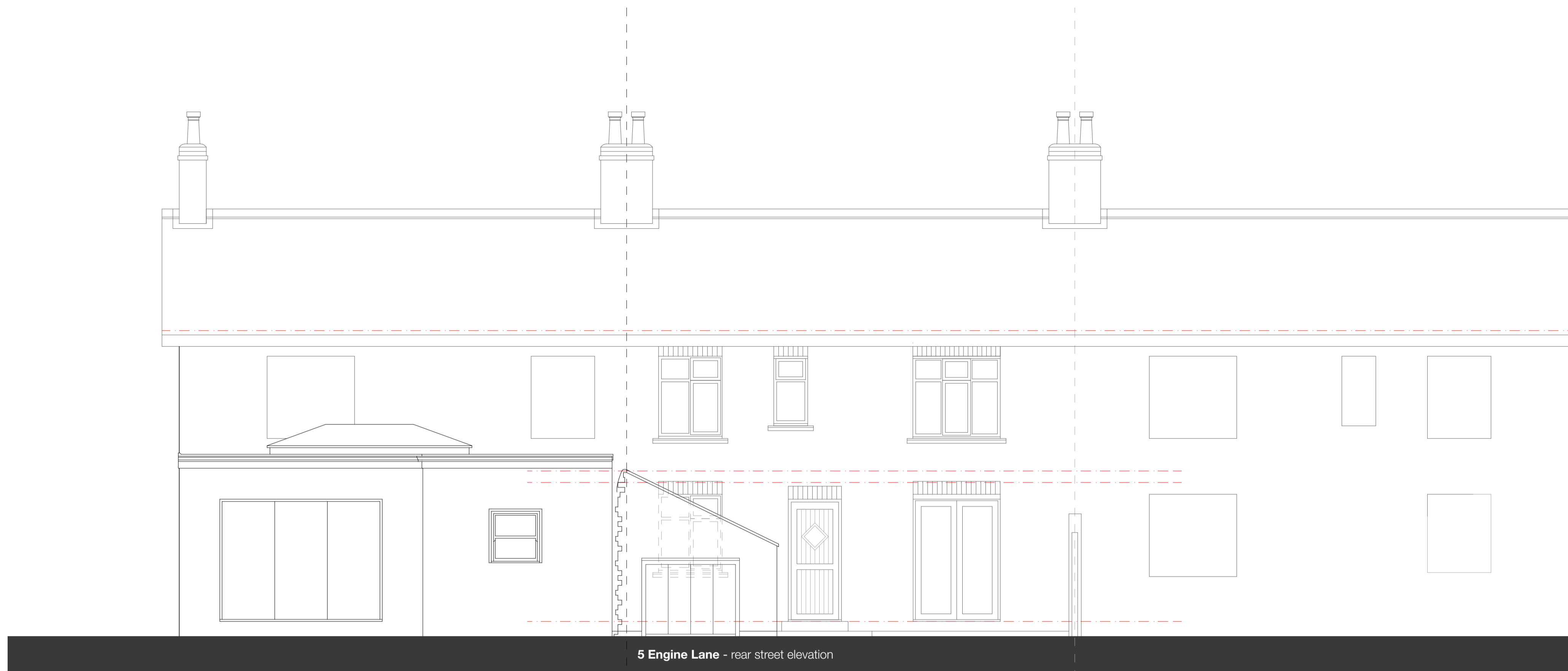
5 Engine Lane - rear street elevation