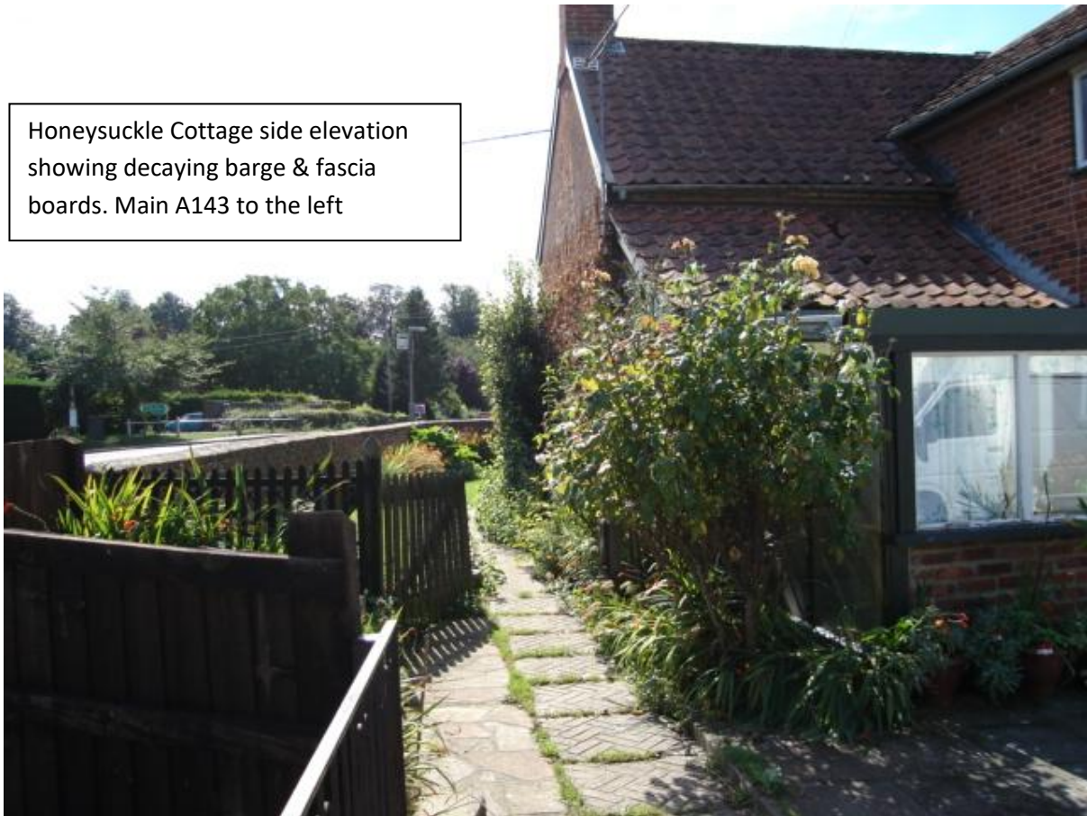
Honeysuckle Cottage side elevation showing decaying barge & fascia boards. Main A143 to the left