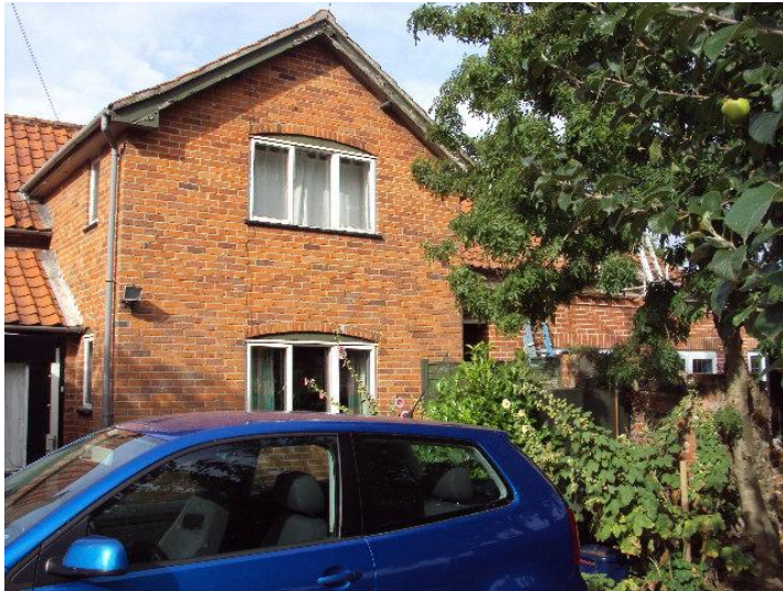
Honeysuckle Cottage Rear Elevation with secondary double-glazing and decaying fascias and barge boards