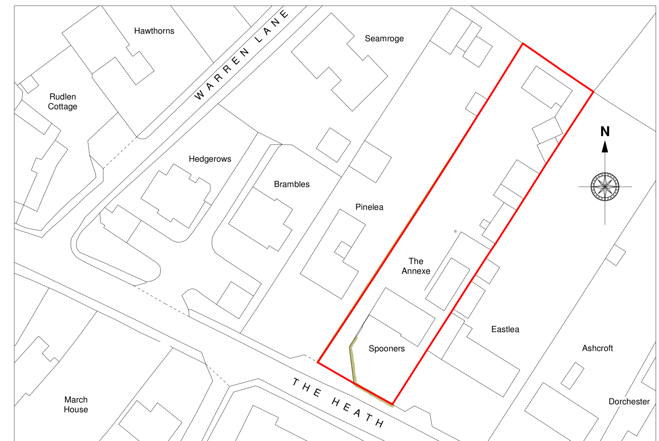
Location Plan 1:500 @ A1