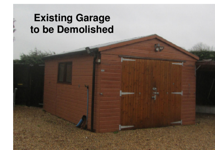
Existing Garage to be Demolished