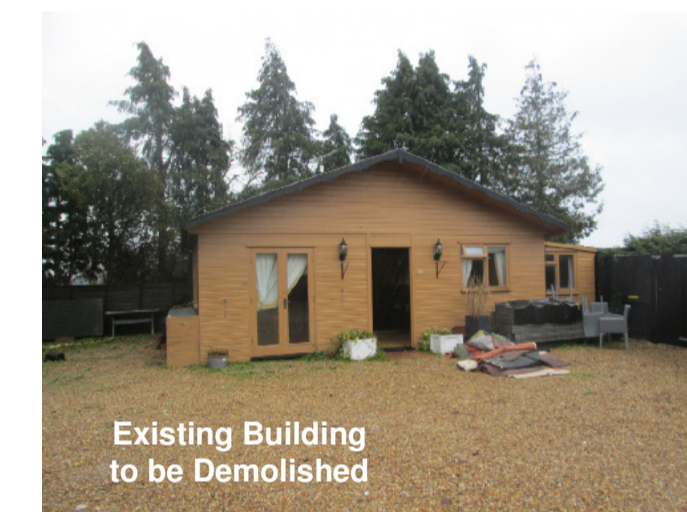
Existing Building to be Demolished