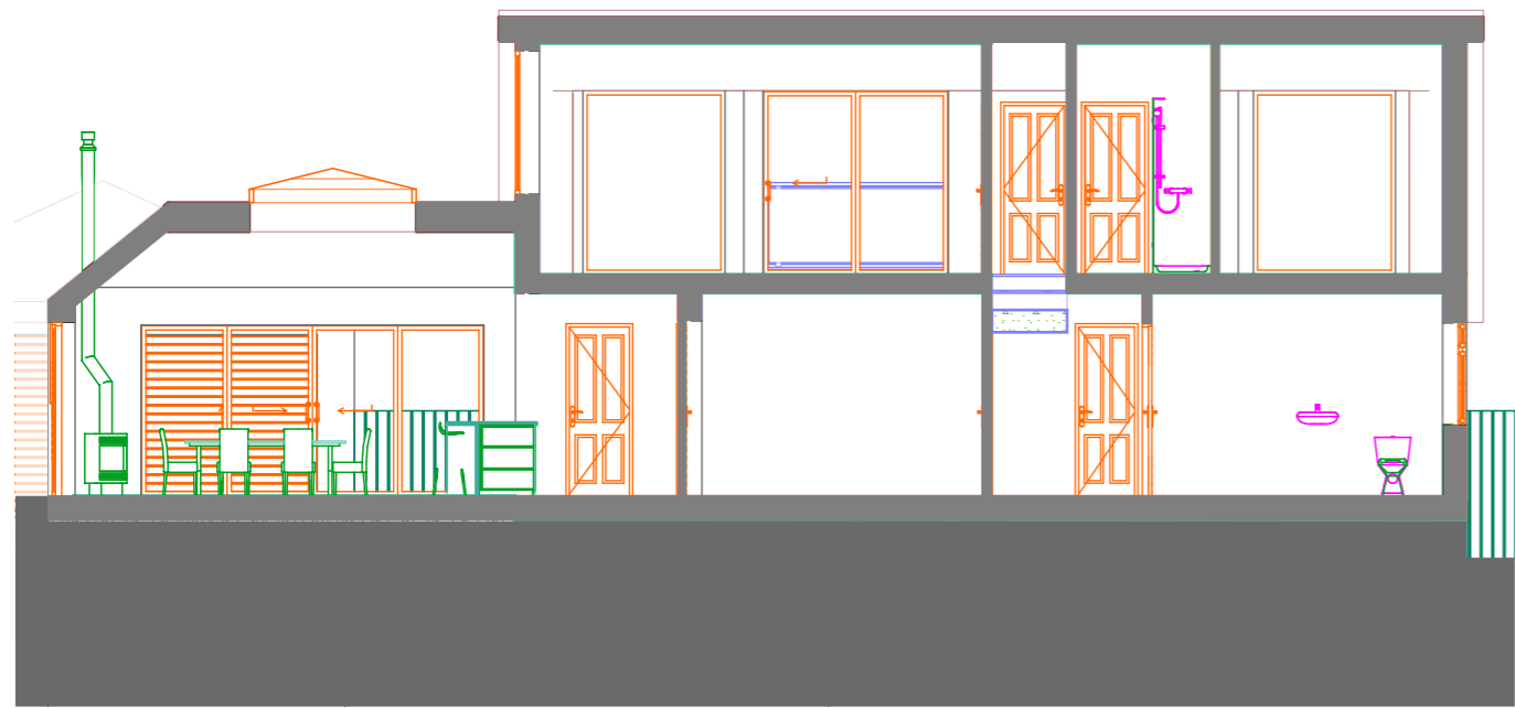
S-01 Section 1:100