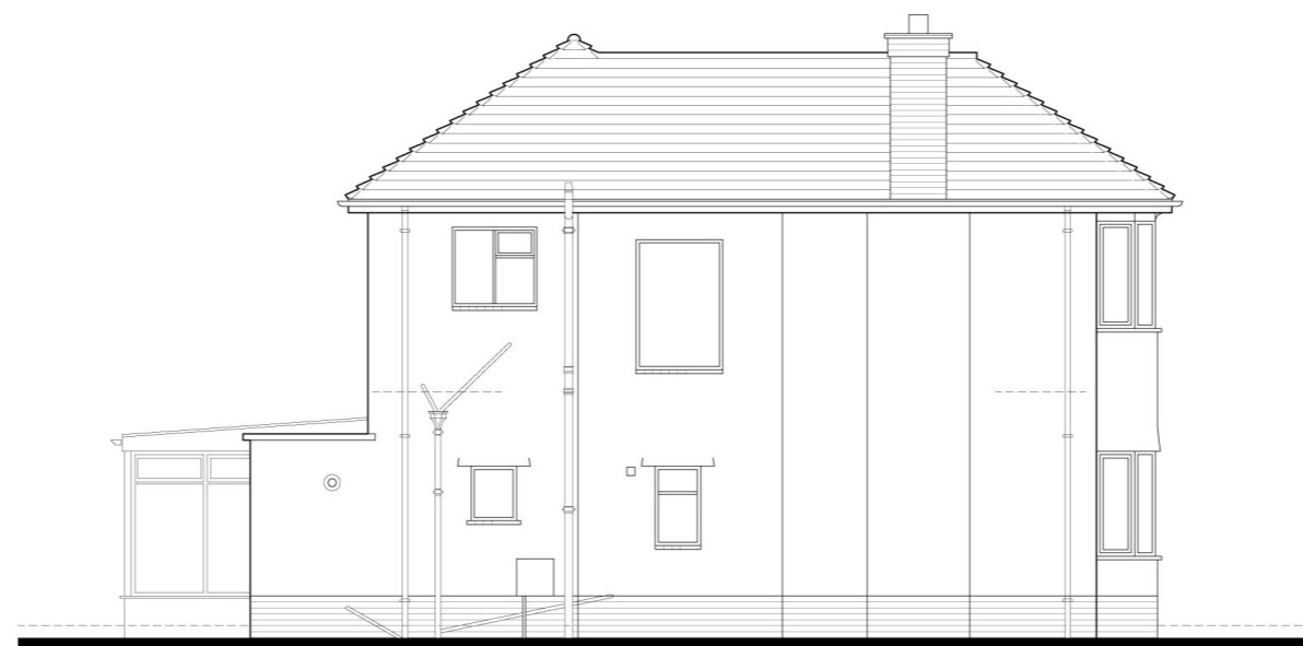
Side Elevation facing North West Scale 1:100