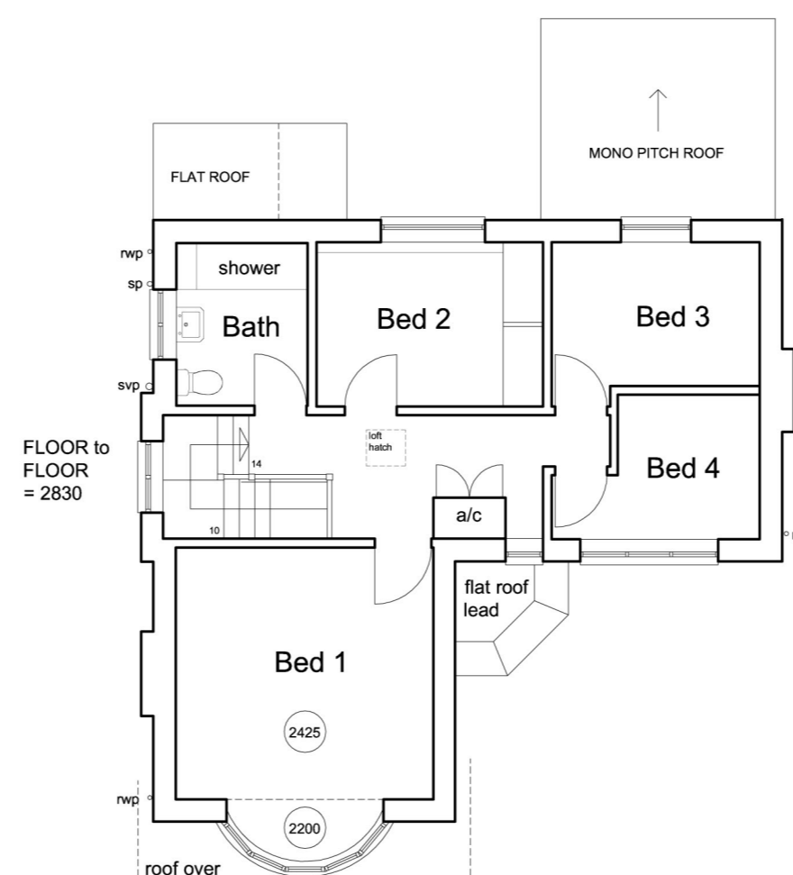
First Floor Plan As Existing Scale 1:100