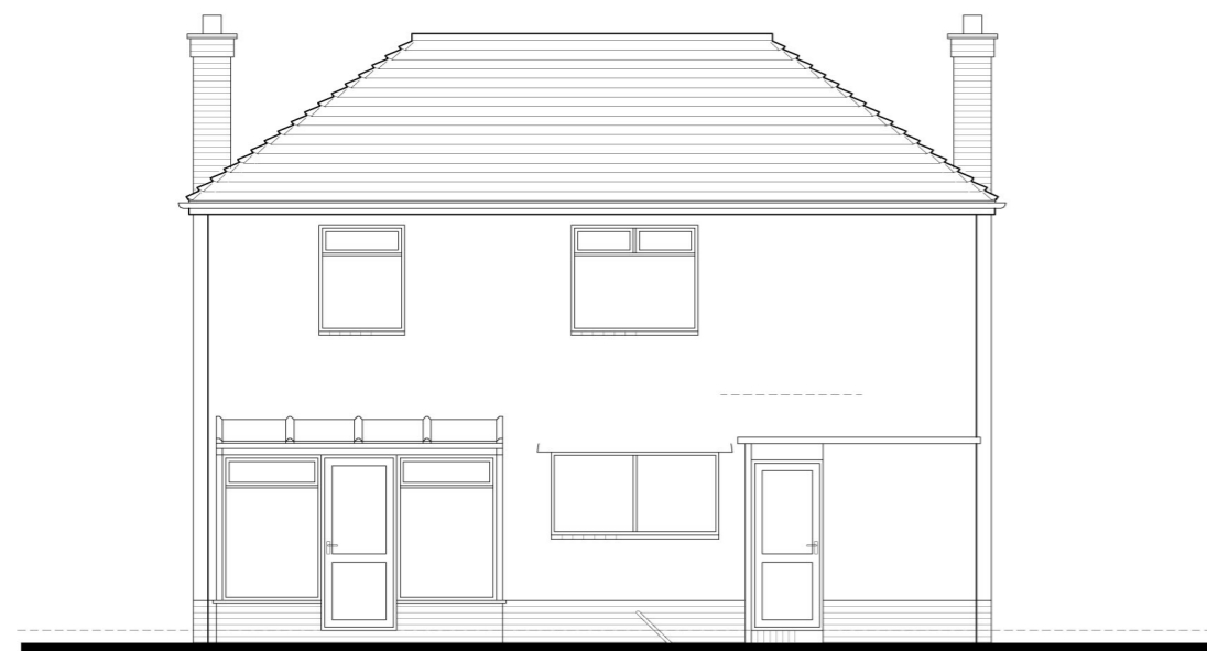
Rear Elevation facing North East Scale 1:100