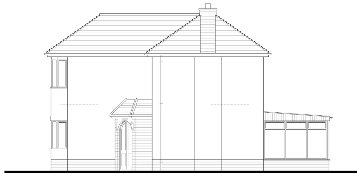
Side Elevation facing South East Scale 1:100