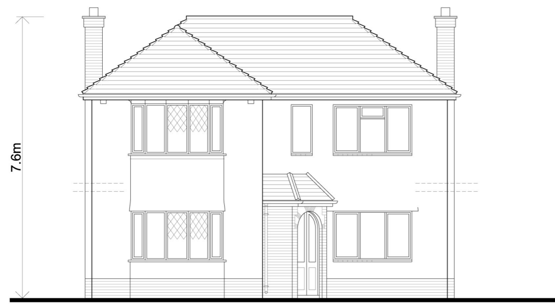
Front Elevation facing South West Scale 1:100