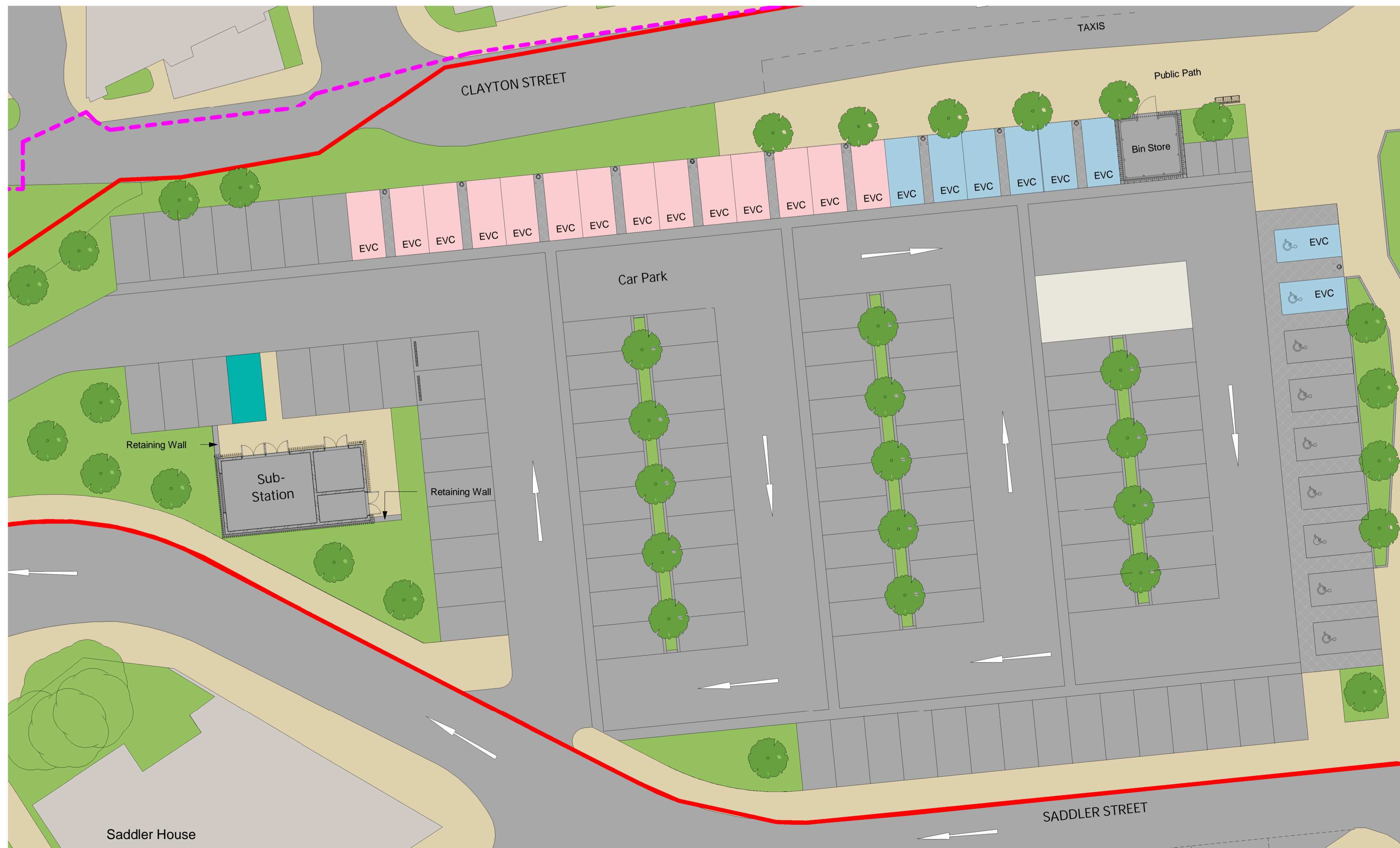
2 - Surface Level Car Park 1 : 200