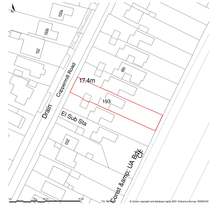
Location Plan 1 : 1250