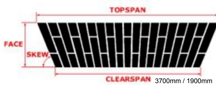
4 Course Flat Gauged