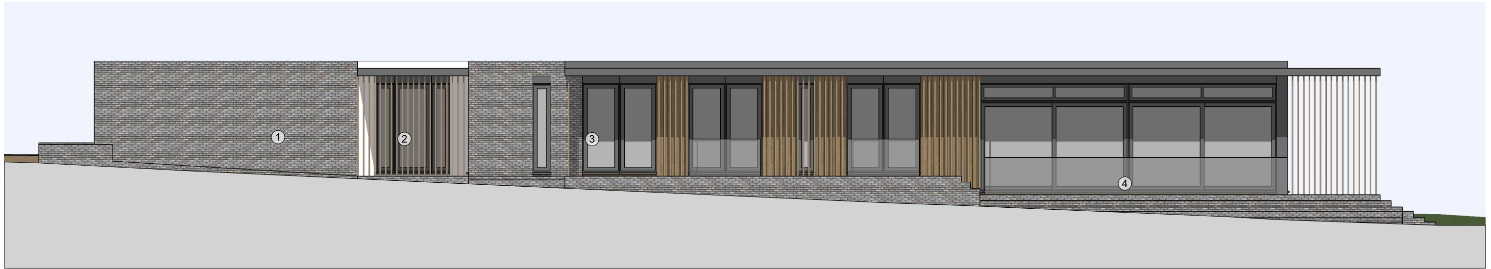
[01] SOUTH ELEVATION (SIDE)