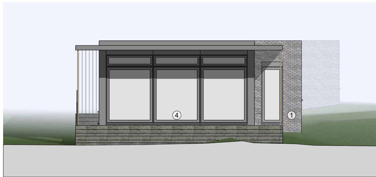
[04] EAST ELEVATION (REAR)