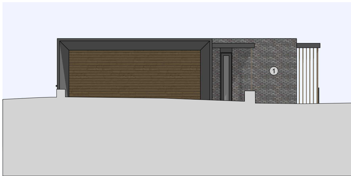
[03] WEST ELEVATION (FRONT)